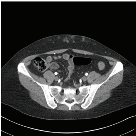
FIGURE 4: CT angiogram of Patient 3 showing multiple small subcutaneous haemorrhages bilaterally at the sites of heparin injections. DIEP branches appear intact in adjacent fat. The inferior epigastric arteries are seen running posterior to the rectus muscle and sheath.

Although there are currently no formal guidelines on the administration site of anticoagulants prior to free flap harvest, it is generally thought that administration of LMWH may damage the vasculature through local haemotoxic and mechanical effects. This could threaten flap viability, as quality and reliability of perfusion are partially dependent on intact subdermal plexus and direct or indirect linking vessel patency [1, 3, 4]. It is equally important to try to avoid compromise to alternative nonintended perforators, just in case a rescue vessel is required. We report three cases of successful abdominal free flap transfer for immediate breast reconstruction surgery after administration of subcutaneous heparin doses into the lower