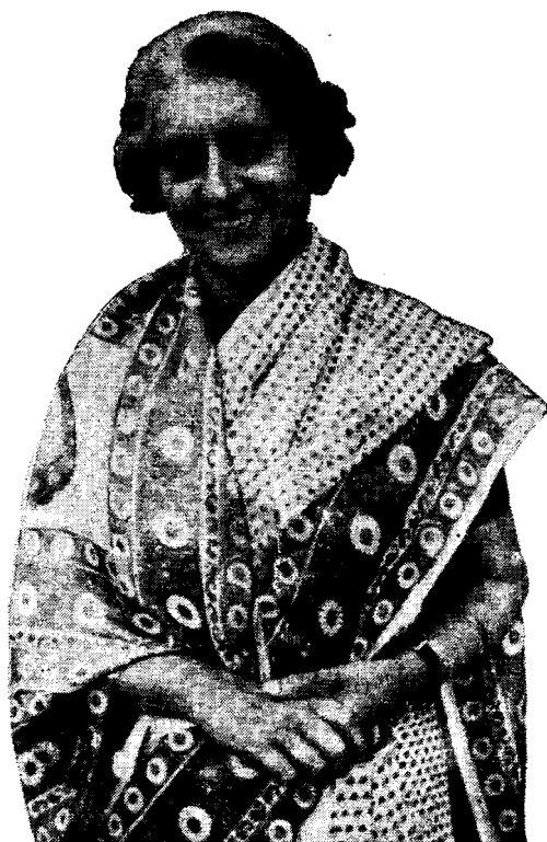
PRIME MINISTER INAUGURATES THE SILVER JUBILEE CELEBRATIONS