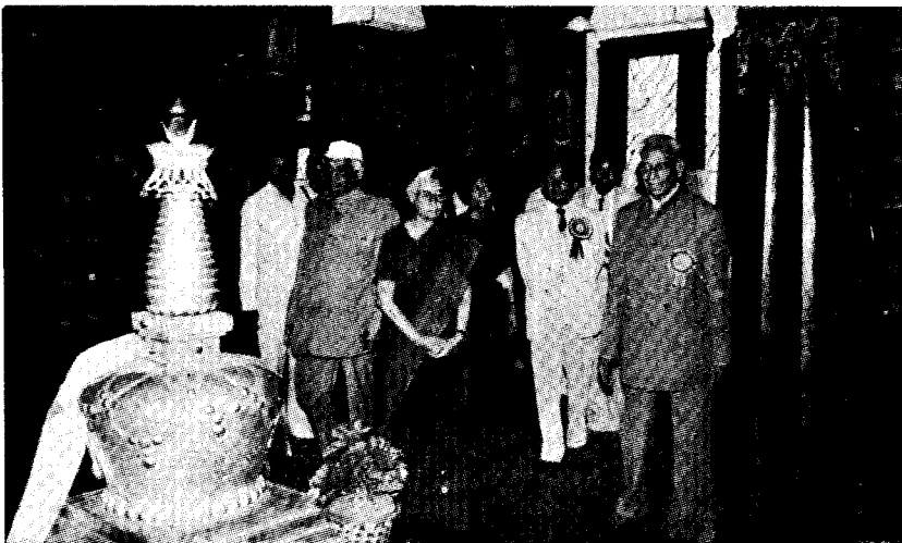
Prime Minister on the first floor of the Institute after placing the khada on the Chorten.