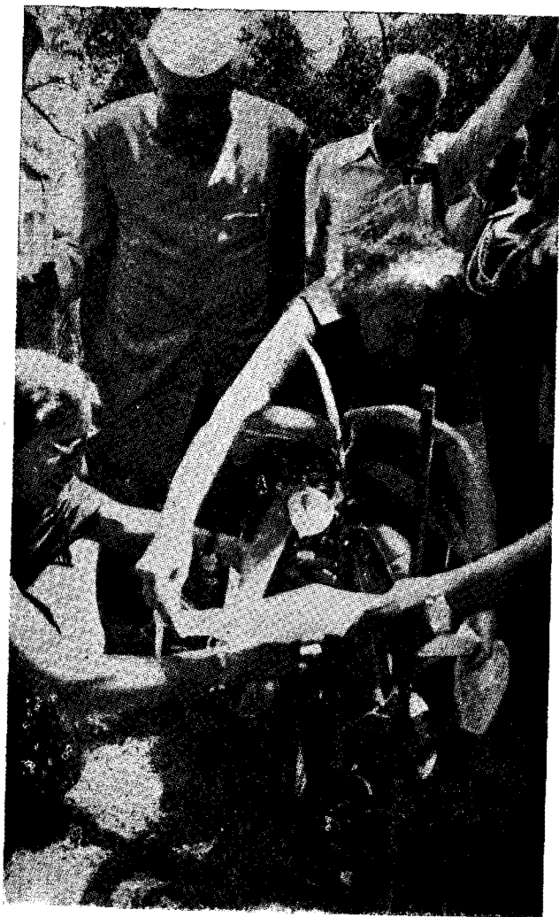
Smt. Indira Gandhi, Prime Minister of India, planting a sapling in the compound of Sikkim Research Institute of Tibetology at the commencement of the Silver Jubilee Celebrations of the Institute.