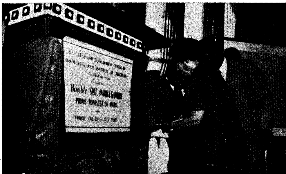
Prime Minister after unfurling the plaque marking the Silver Jubilee Celebrations at the entrance of Sikkim Research Institute of Tibetology before entering the building. ( Top )