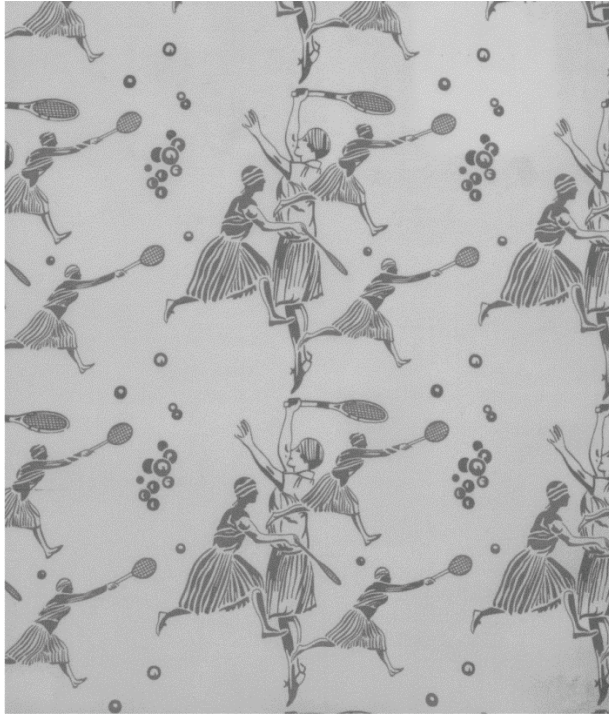
Printed silk crêpe de chine dress fabric, designed by Helen Wills for Stehli Silks, New York, 1927.