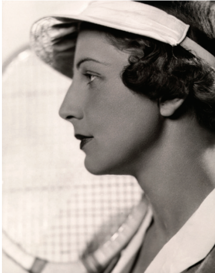
Bromide Print, 1933 (218 mm x 174 mm).