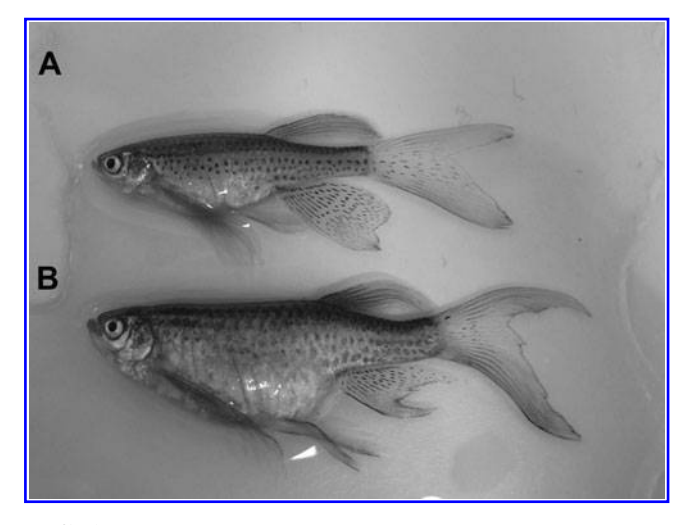
FIG. 1. Example of a descriptive annotation of a zebrafish welfare concern. (A) Normal appearance of zebrafish, (B) female with enlarged abdomen, which would be annotated as abdomen_general_distended .