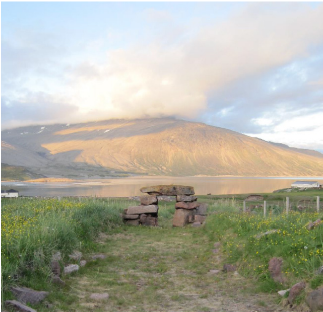
Fig. 1. The Demise of Norse Greenland.

is still limited attention paid to deep time perspectives in contemporary mainstream studies of adaptation to climate change (Riede 2014a). The short timescales used in contemporary adaptation research are often limited to the multi-decadal timescales captured by instrumental readings; this limits our understanding of social-ecological resilience (Redman 2005; Voss et al. 2014). Long-term historical datasets offer known social-ecological responses to climate impacts, human resource use and extreme geophysical events (Pandolfi et al. 2003; Riede 2014b). These historical and archaeological resources are significant if we are to understand how sustainable today's adaptation planning will be to future climate change (Adger and Barnett 2009; Erikson and Brown 2011; Hartman et al. 2017; Redman 2005). Cases of societal collapse (or demise), such as that of Norse Greenland (fig. 1), have the potential to explain how cultural continuity and social and economic structures in society can limit capacities to respond to environmental change (see Dugmore et al. 2012,