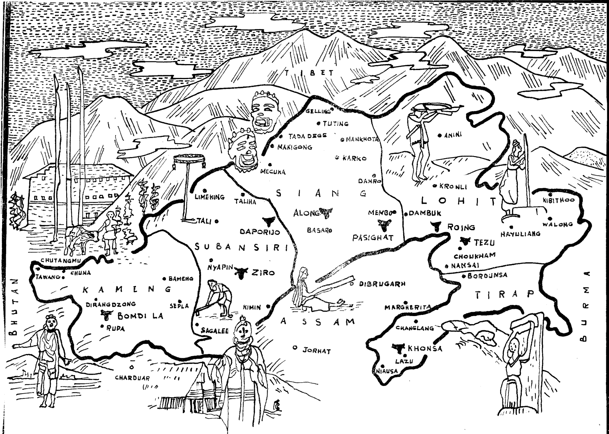
THE NORTH-EAST FRONTIER AGENCY