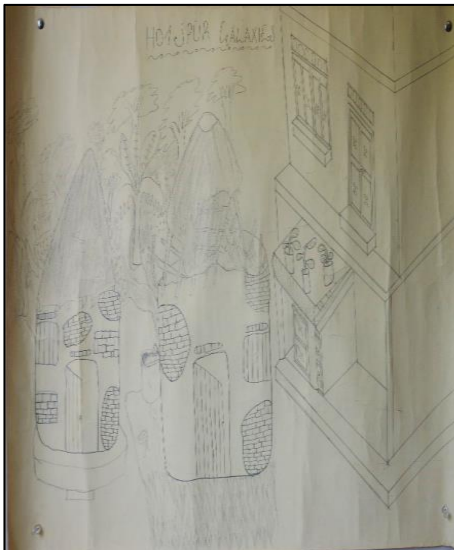
Figure 3: Learners' sketch of Kasemiire's homes by the Hotspur Galaxies Group

the learners to return the sketches after one week and Figure 3 below shows one of the sketches: