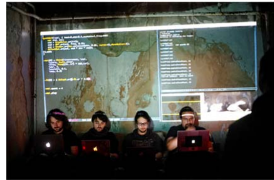
Figure 2 – Benoit and the Mandelbrots, from the Supercollider Symposium 2012 "Livecode Evening": "Codefaced people hacking music live in front of your eyes. Live coding is a new direction in electronic music and video: live coders expose and rewire the innards of software while it generates improvised music and/or visuals"

Perhaps uniquely to live-coding, this programming practice is not carried out with the ultimate goal of realizing some design outcome, but is instead a continuous performance, with the journey itself being the principal intended outcome. To stress this point, early live-coding performers often ended their acts by purposefully breaking what they had created: inserting faults into their code, which crash, disrupt or delete their program, ideally producing interesting visual and audio glitch effects as it dies.