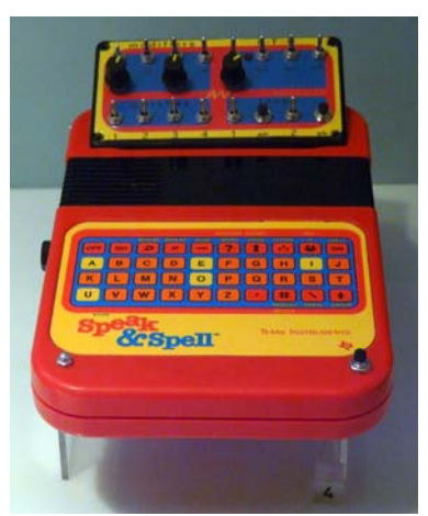
Figure 3 – A Circuit-Bent Speak & Spell, as exhibited at the London Science Museum. Switches, buttons and potentiometers have been added to the device, controlling the modifications made to its circuits.

Where circuit-bending opens up a plastic case to access electrical connections, in code-bending [54], the internal API of open-source software is re-purposed, so that instead of fulfilling its originally intended internal function, it is used for external communication. While internal interfaces are not usually accessible in closed-source programs, with open-source software, one can figuratively "lift the lid" to experiment with these interfaces, even if the APIs are not fully documented. Existing software can thus, in a comparatively rapid, playful manner, be repurposed, encouraging an explorative approach to implementation.