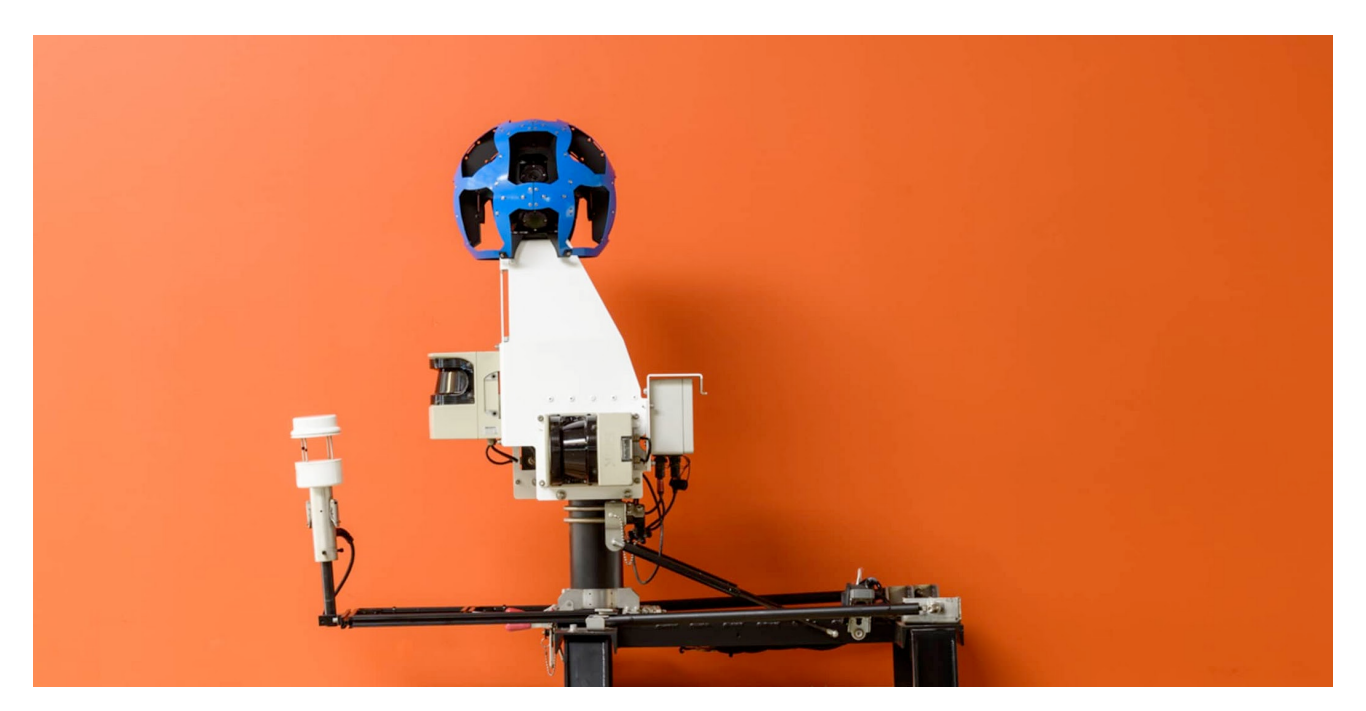
Figure 3: Google Street View air-pollution sensors. Available at <a href="https://sustainability.google/projects/airview">https://sustainability.google/projects/airview</a>.

promoting sustainability. Yet in researching and practicing in this area of media and environment, it is worthwhile to question: How do these environmental technologies help to mitigate the escalation of a warming and polluted planet? Or, alternatively, to what extent do they monitor a crisis that they have helped to create?<sup>3</sup>