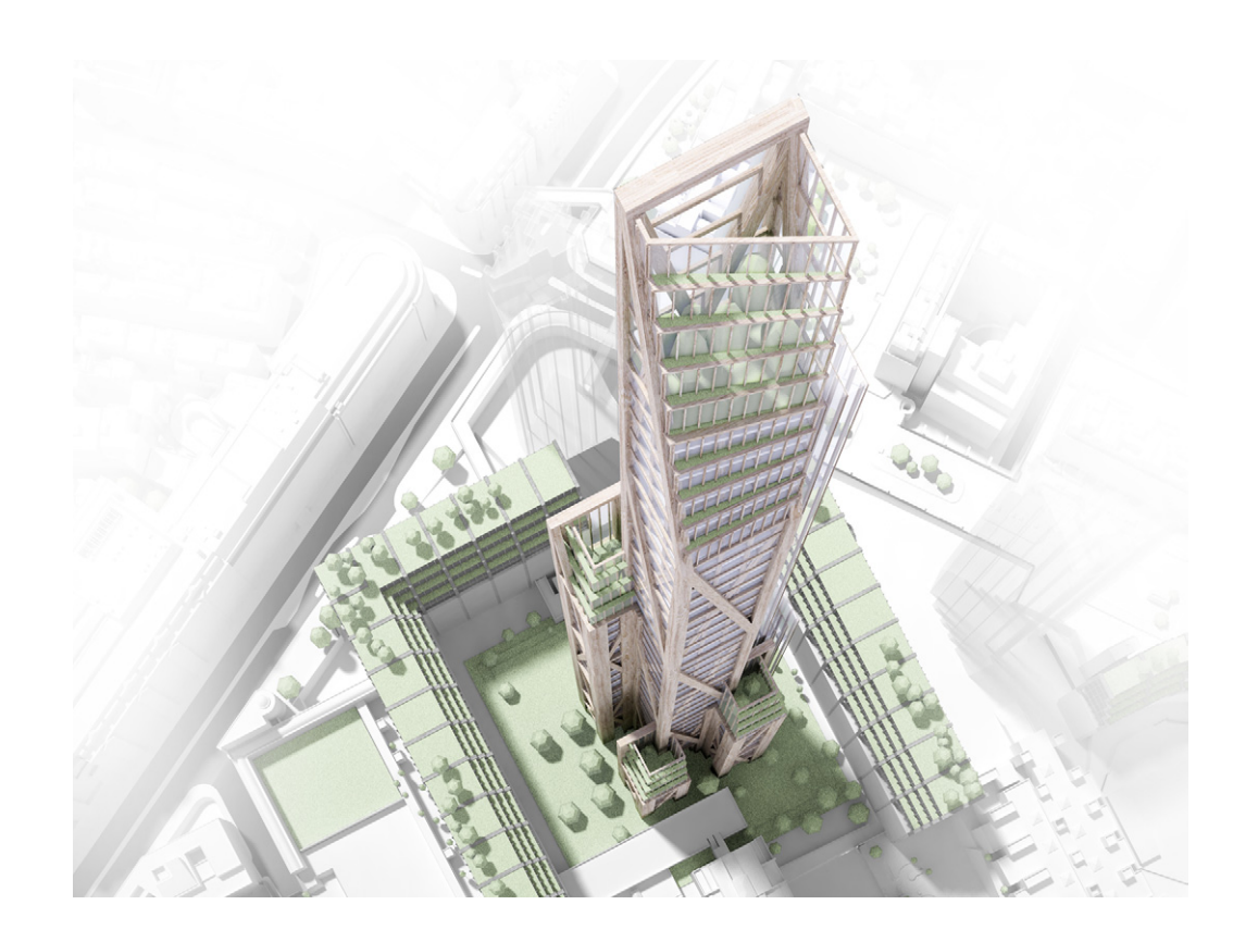
Figure 2. Architect's birds-eye visualisation of Oakwood Tower. Reproduced with permission, image copyright PLP Architecture

parallel-to-grain capacity and mitigation of anisotropy through off-parallel use of material. This is a trade-off familiar to designers of fibre-reinforced composites and the transfer of understanding from fibre composite design is likely to be an important feature of future advanced engineered timber design.