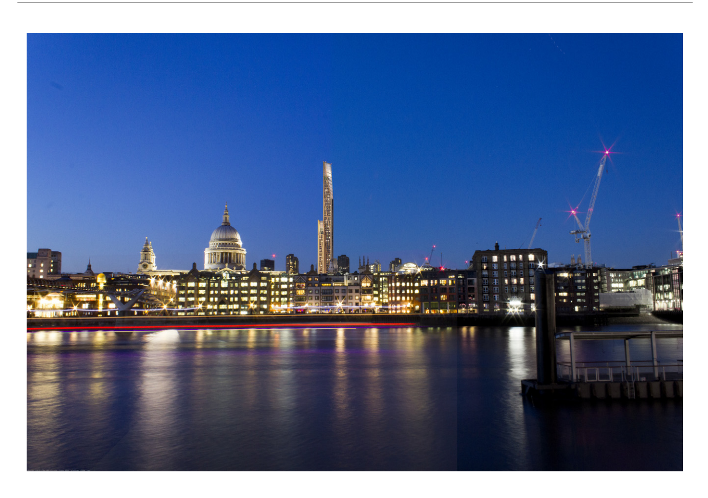
Figure 1. Architect's visualisation of Oakwood Tower.

solutions. A further architectural desire to lighten the presence of the tower, while achieving a variable wind profile to resist dynamic excitation, generated the spiral stepping of building height that also allows for buttressing of the central tower by the bundled sub-towers (Figure 2). Although this initially appears to lead to inefficient cladding (i.e. poor floor-plate perimeter to area ratio), this is offset by the improved natural light penetration and the markedly increased provision of high-value dual-aspect office or residential spaces.