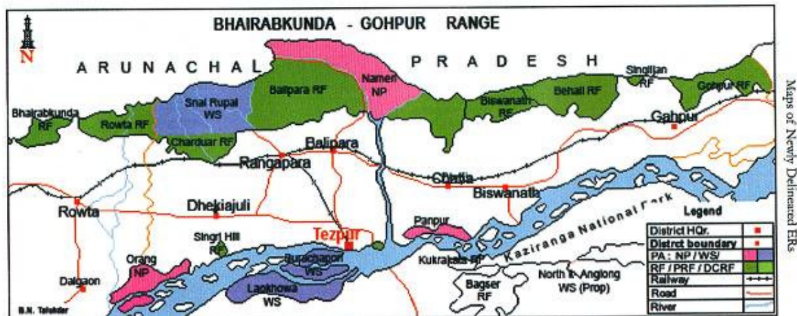
Figure 1: Institutional cartography of the Sonitpur Elephant Reserve. Shaded areas in green, pink and dark blue indicate formally designated protected areas; white indicates human settlement.