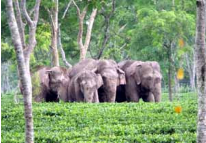
Figure 3: The SPo4 herd (left to right: Tara-4, Tara-3, Tara-1 and Tara-5) in a tea plantation.

team was monitoring the activities of a herd of four bull elephants, named SPo4, an activity they referred to as ‘tracking’. Led by Tara-1, the dominant mukhna 4 , SPo4 had become experts at raiding crops and breaking into houses for stored food grain. The three other elephants in the herd included Tara-3, a subadult male about 10 years old, and two older animals Tara-4 and Tara-5 (Figure 3). A fifth elephant, Tara-2, had left the herd before I had commenced fieldwork. The prefix Tara- attached to their names stemmed from Tarajuli, the place where the AHP team first identified the herd in 2006.