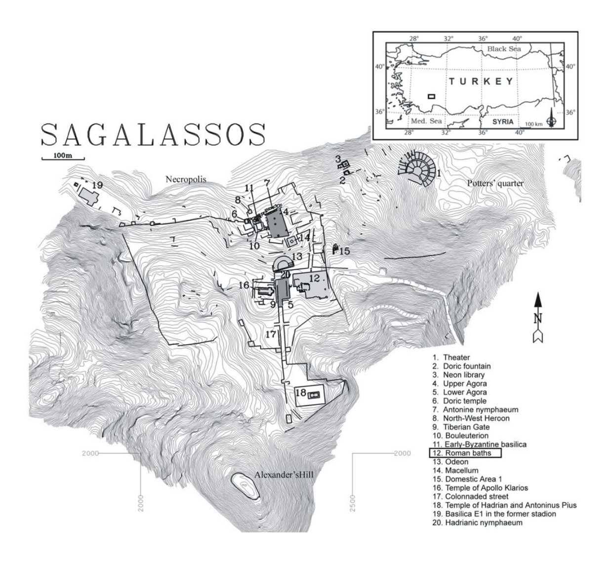
Figure 1. Map showing location of Sagalassos in Asia Minor, and location of the Roman Baths (12) within the city.