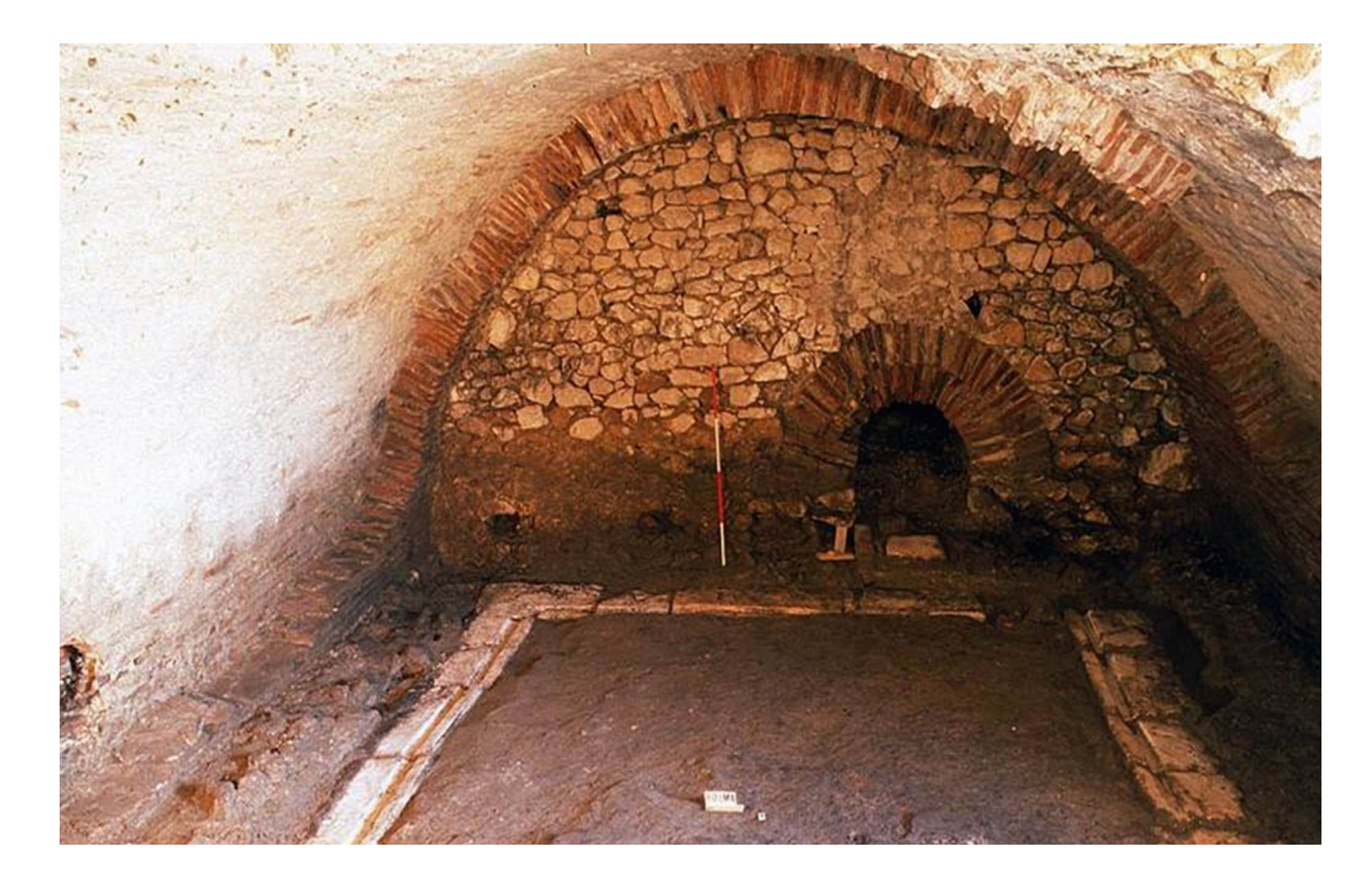
Figure 2. Photograph of the latrines (Room 4) at Sagalassos.