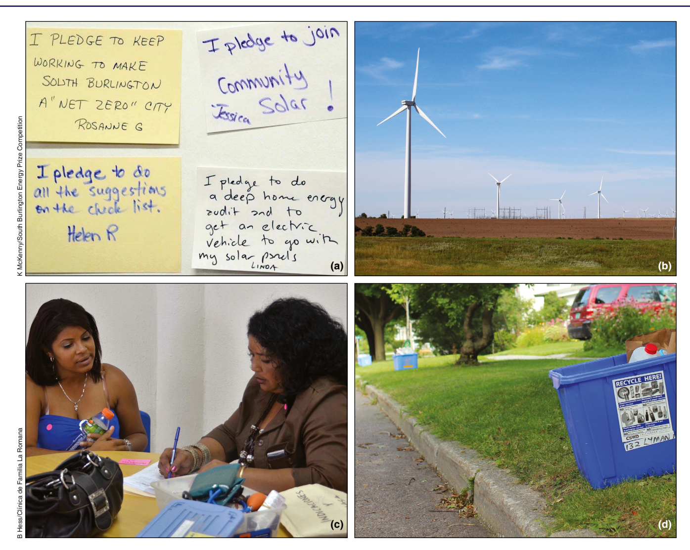
Figure 1. Examples of targeting contextual variables to increase pro-social and pro-environmental behavior. (a) Pledges elicit commitments that spur action to reduce energy use; (b) automatically enrolling consumers in green energy programs increases participation compared to a default where people must opt in; (c) health information is more effective when the messenger suggesting the behavior change is perceived as similar; (d) the behavior of peers and neighbors indicates social norms that promote recycling.

tion, these contextual variables often moderate behavior through automatic, unconscious cognitive processes (Dolan et al. 2012).