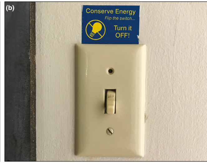
Figure 2. Examples of using priming and salience to influence behavior. (a) Displays of healthy foods prime shoppers to purchase healthier food items; (b) reminders and prompts make energy use and conservation salient.

options available to policy makers and those designing conservation programs.