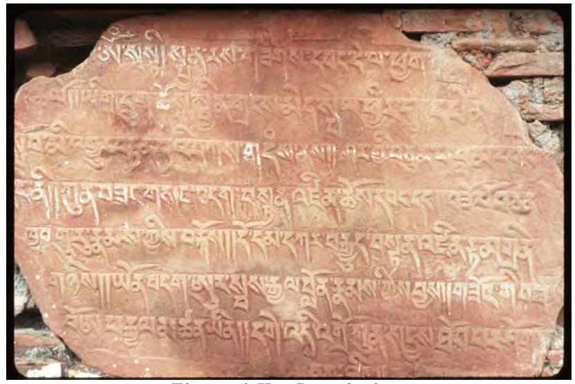
Figure 1 Ura Inscription