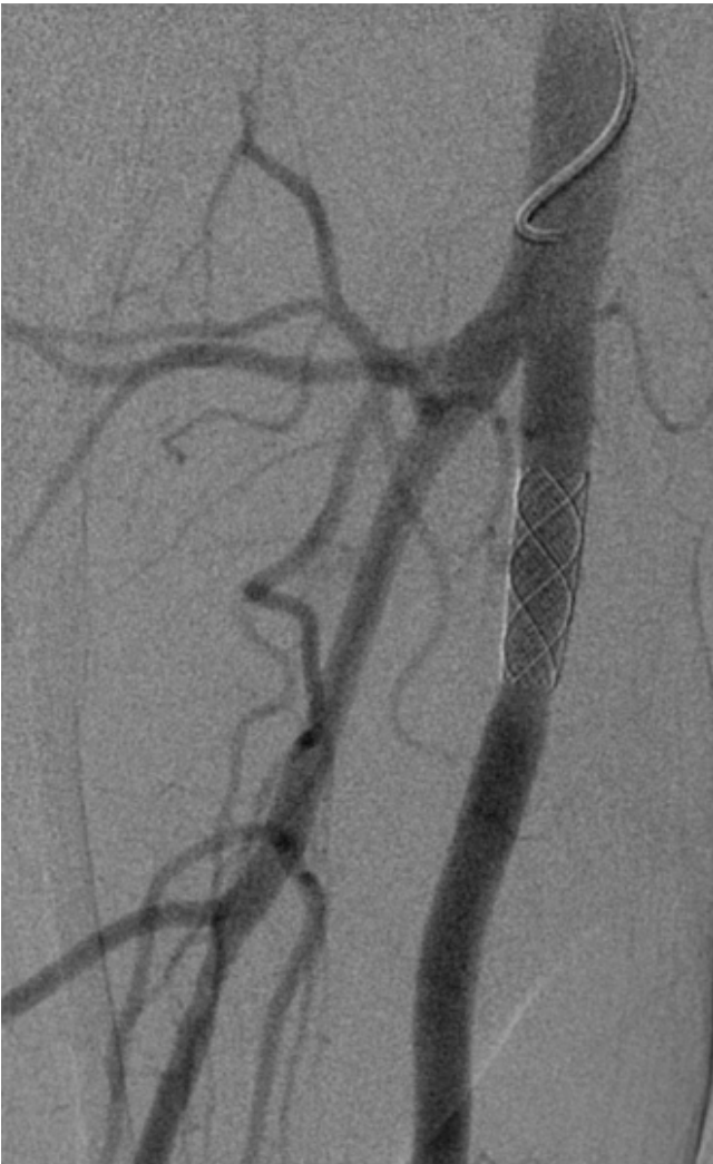
Figure 4 Complete exclusion of arterio-venous fistula following endovascular repair.