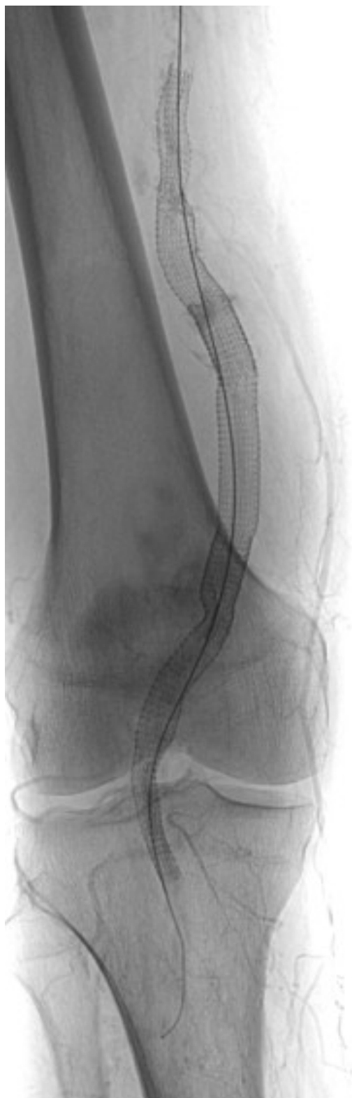
Figure 2 Complete exclusion of popliteal aneurysm following endovascular stenting.