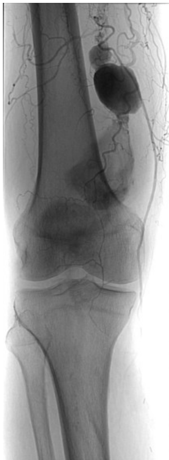
Figure 1 Popliteal artery aneurysm.

Endovascular stenting can also be used in treating arterio-venous fistulas/malformations and pseudoaneurysms in elective and emergency setting. This can be done by using covered stents or by coil embolization. There are many case reports in which it has been used to treat femoral [11,12], popliteal [13,14], tibial pseudoaneurysms [15,16] and arterio-venous malformations [17,18]. In our experience this is a safe, minimally-invasive intervention which ensures an early return to work and a minimal hospital stay [19]. The importance of endovascular stenting is quite significant in patients who develop pseudoaneurysms following orthopaedic procedures like total or partial knee replacement or during knee arthroplasty. These can present in both emergency and elective settings. Because of the hostile operative field, the endovascular approach offers a quick fix to the problem. Both covered