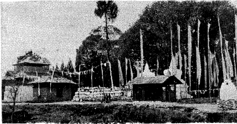
View of the stupas adjacent to the shrine

In brief, the seed of enlightenment is obtained by taking a drop of this Bumchu water thereby all the distress, evil spirits and untoward happenings are removed. And prosperity and fulfilments are rewarded in this life and one attains Buddhahood or be born in the Riwo Potala or Zangdopalri in the next life.