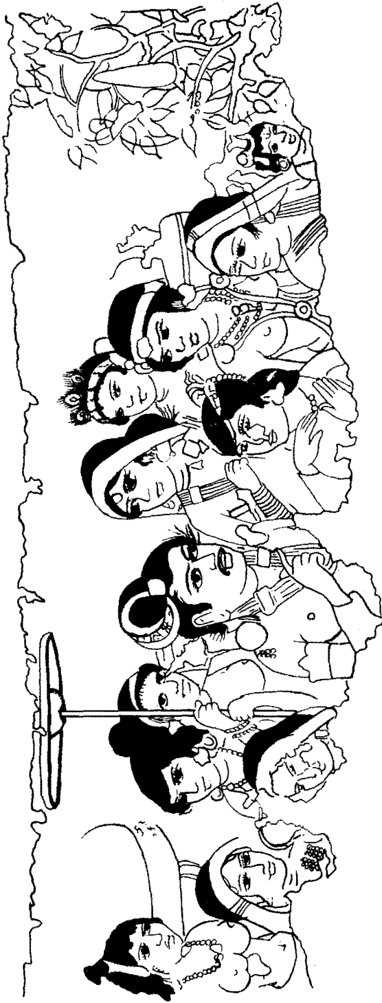
Fig. 4: Ajanta, Cave 10: Part of a scene depicting worship of the Bodhi tree