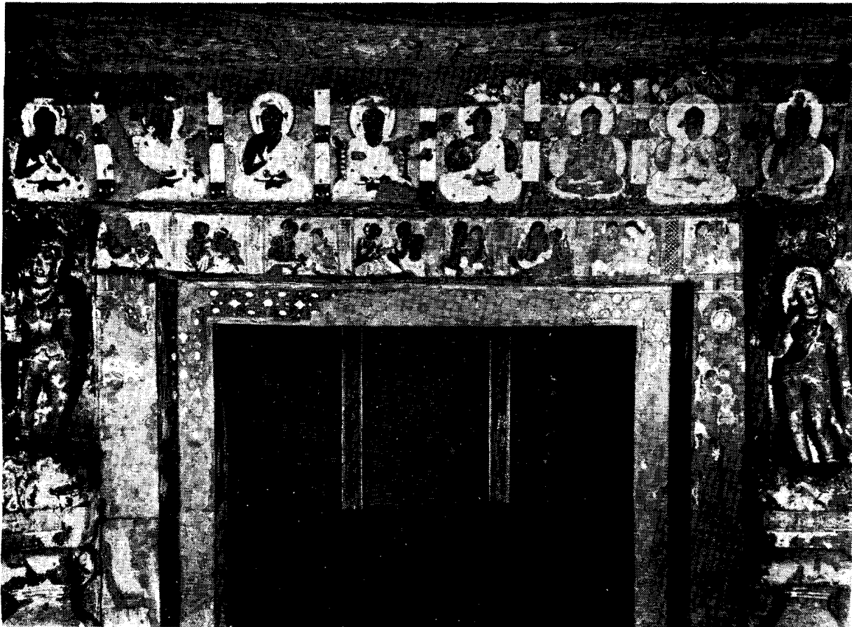
Plate XIII. Ajanta, Cave 17 : paintings and sculptures on the entrance

The back wall of the verandah of Cave 17 fortunately retains a fair amount of paintings and thus helps in understanding the manner the