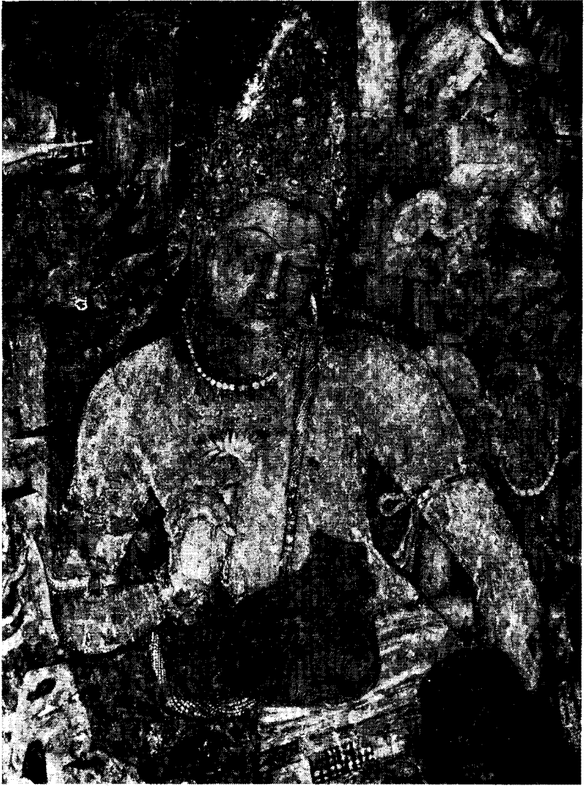
Plate XII. Ajanta, Cave 1 : Bodhisattva Padmapāni

beings. In one inscription the gift is said to endow on the donor good looks, good luck and good qualities. The miracle of Śrāvastī was also a very popular subject at Ajanta. Rows of Buddha figures, one above the other, came to be painted so as to depict the Thousand Buddhas. In Cave 2 there is an inscribed record mentioning the subject as 'Thousand Buddhas' ( Budha Sahasa ).