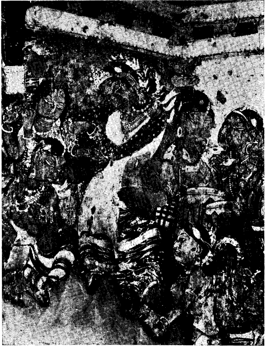
Plate XIV. Ajanta, Cave 1: scene from the Mahajanaka Jataka depicting a dance

The greatest quality of Ajanta paintings is, however, that it is imbued with feeling and can be appropriately called a bhāvachitra . Bhāvachitra is defined as that type of painting where the rasas such as śringāra , etc. are revealed to a person by mere observation and which create wonder in mind ( śringārādiraso yatra darśanādeva gamyate/bhāvachitraṁ tadā-khyatāṁ chittakautukakārakāṁ ).