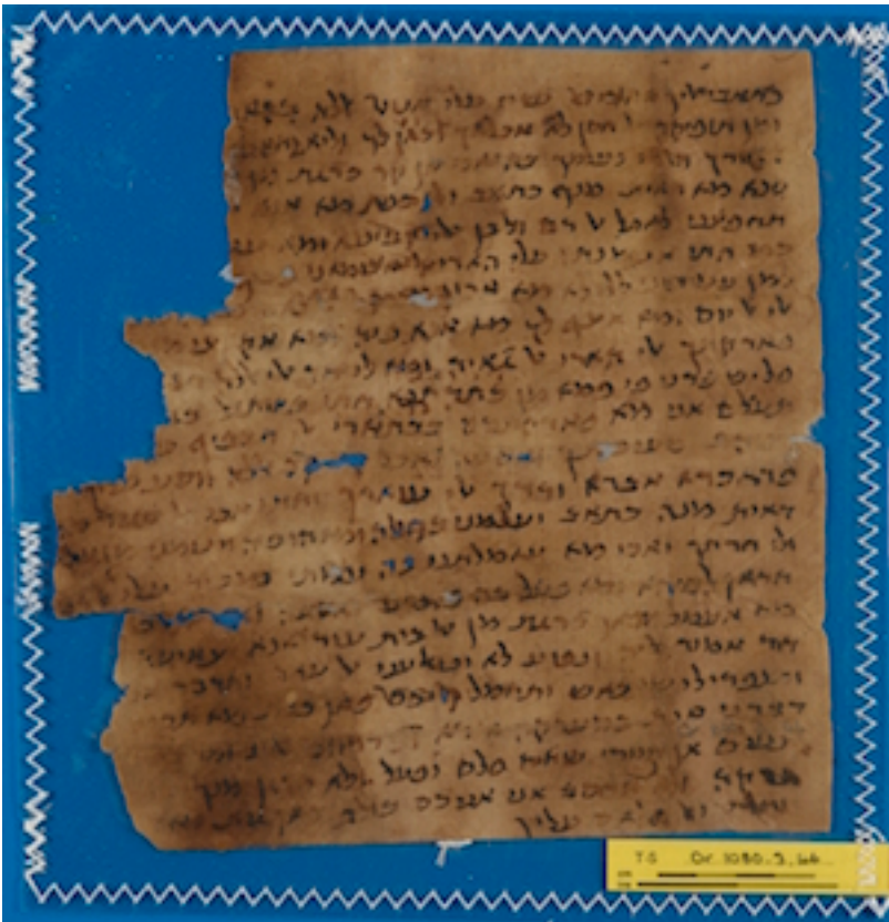
Cambridge University Library Or. 1080 3.46