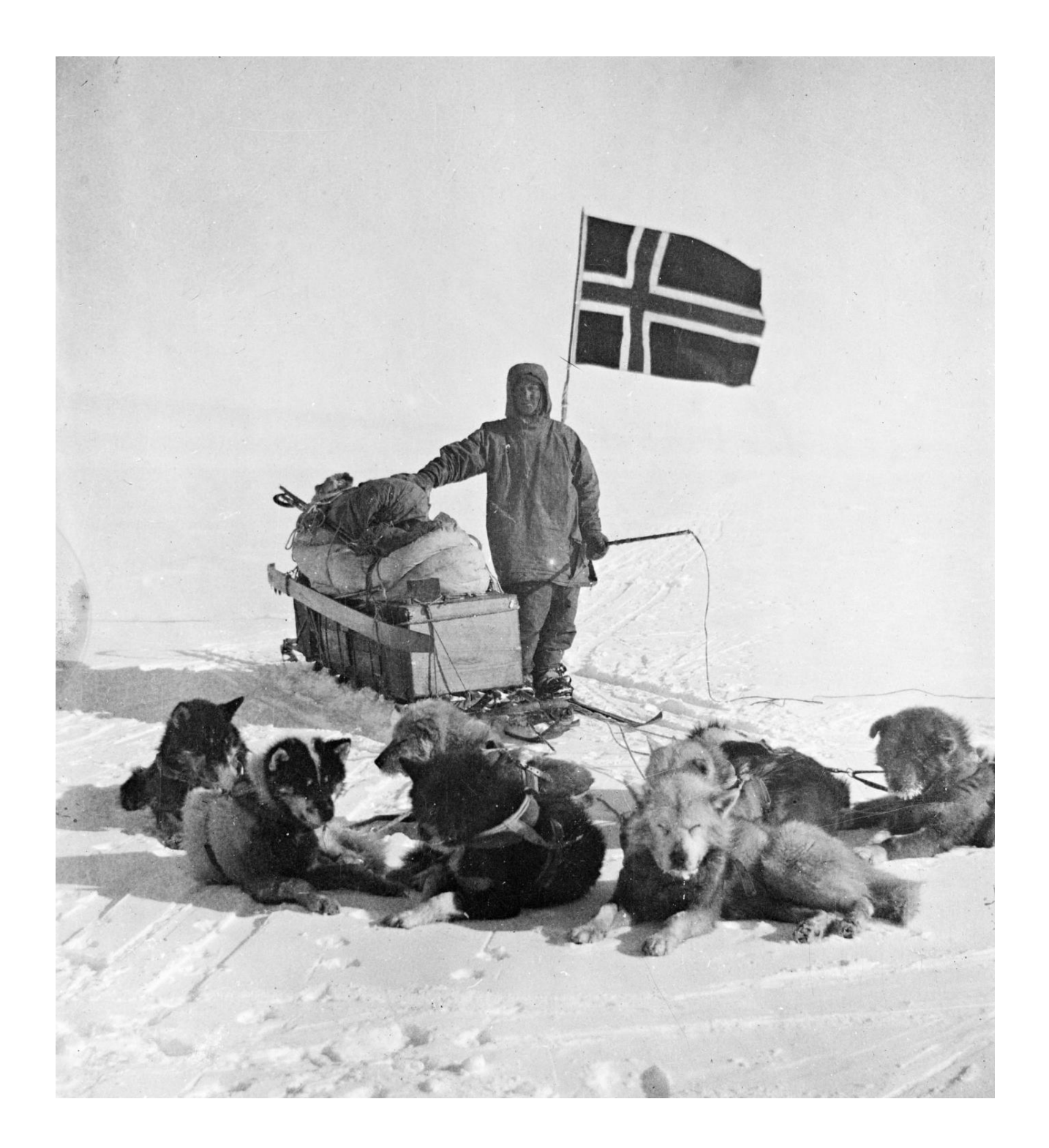
Fig. 5. Oscar Wisting photographed close to the South Pole under the Norwegian flag. Fastened to the sledge is an under runner similar to the two which were later broken in half to use as flag poles for the reckonings placed to encircle the South Pole.

One pair of under-runners was broken in half to give four poles, each approximately 6 foot long, which could be planted easily. This supposition is consistent with the proportions of the sledge runner and flag shown in