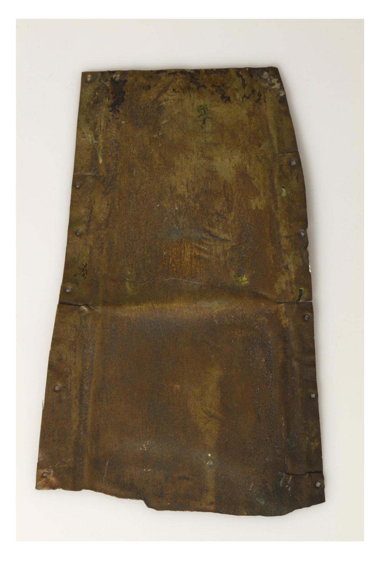
Fig.2. The Forbes sledge shoe fragment.