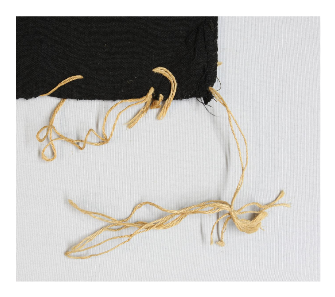
Fig. 7. Detail of the looped, knotted and cut string from the upper edge of the depot flag N: 1038 (Point A).

By measuring the full length of these the circumference of the flagpole can be deduced. This measurement is 160mm. The sledge fragment is 56mm wide at the narrowest, and the sledge runner was 1cm thick, as evidenced by the folds in the metal. This means that at the narrowest point on the metal shoe the circumference of the sledge runner was around 132mm. The string could therefore easily have been looped around the tapering top end of the wooden sledge runner slightly further down from the narrowest point of the metal.