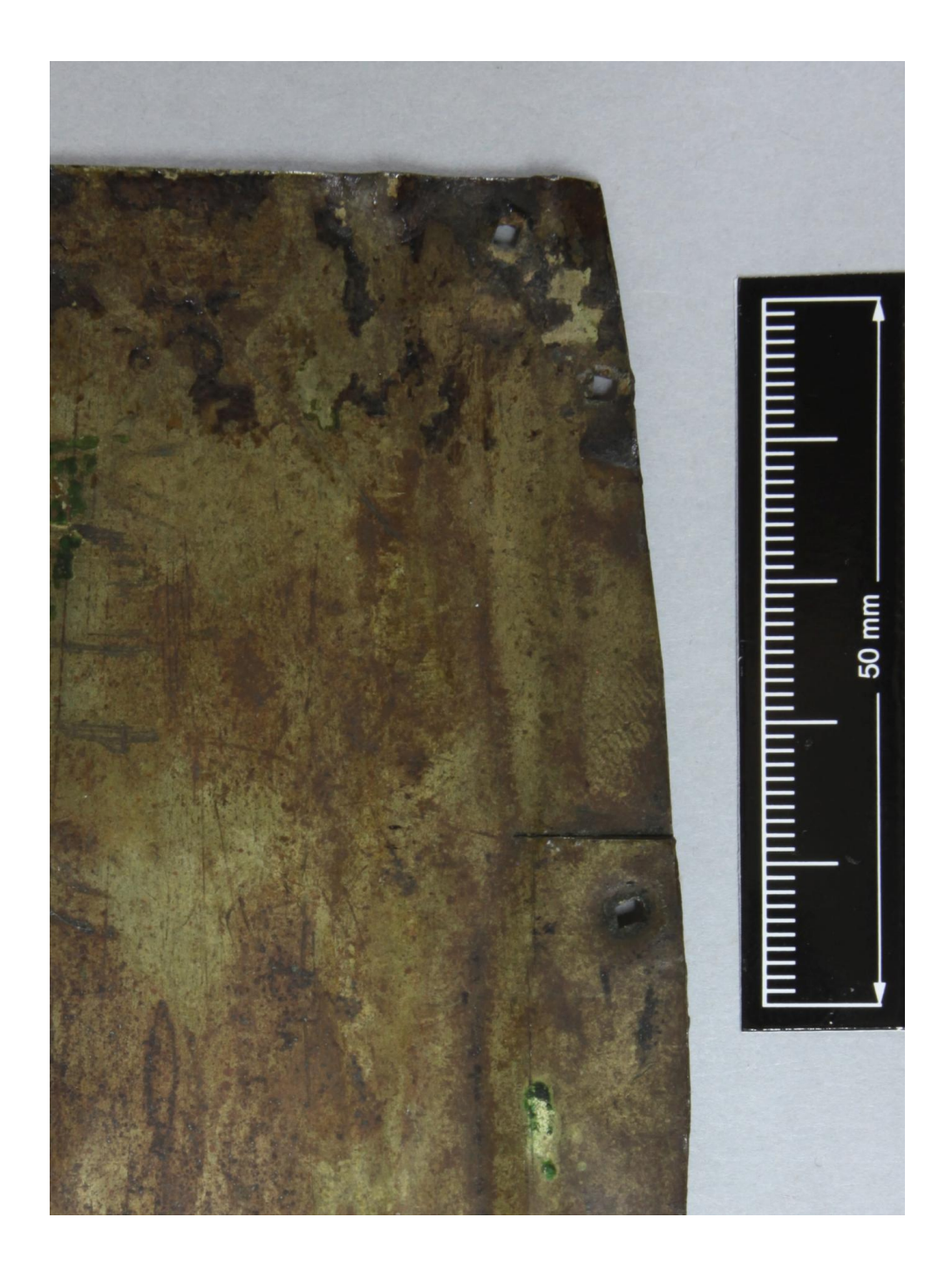
Fig. 3. Detail showing the square nail holes in the Forbes fragment.

The nail holes are not evenly spaced along the length of the fragment, nor do their positions match the holes on the opposite side of the shoe. At the narrowest end of the fragment there is a pair of nail holes close together on one side. The outermost nail would have fixed the metal to the top of the runner, like all the