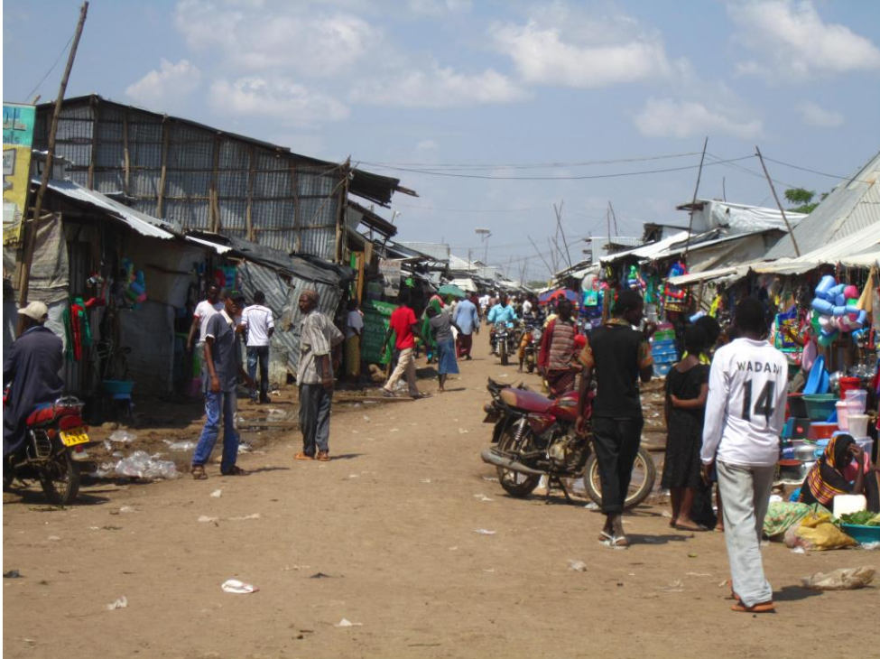
PHOTO 2 Recently established section of the Dadaab refugee camp