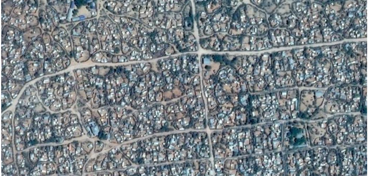
PHOTO 3 Older section of the Dadaab refugee camp