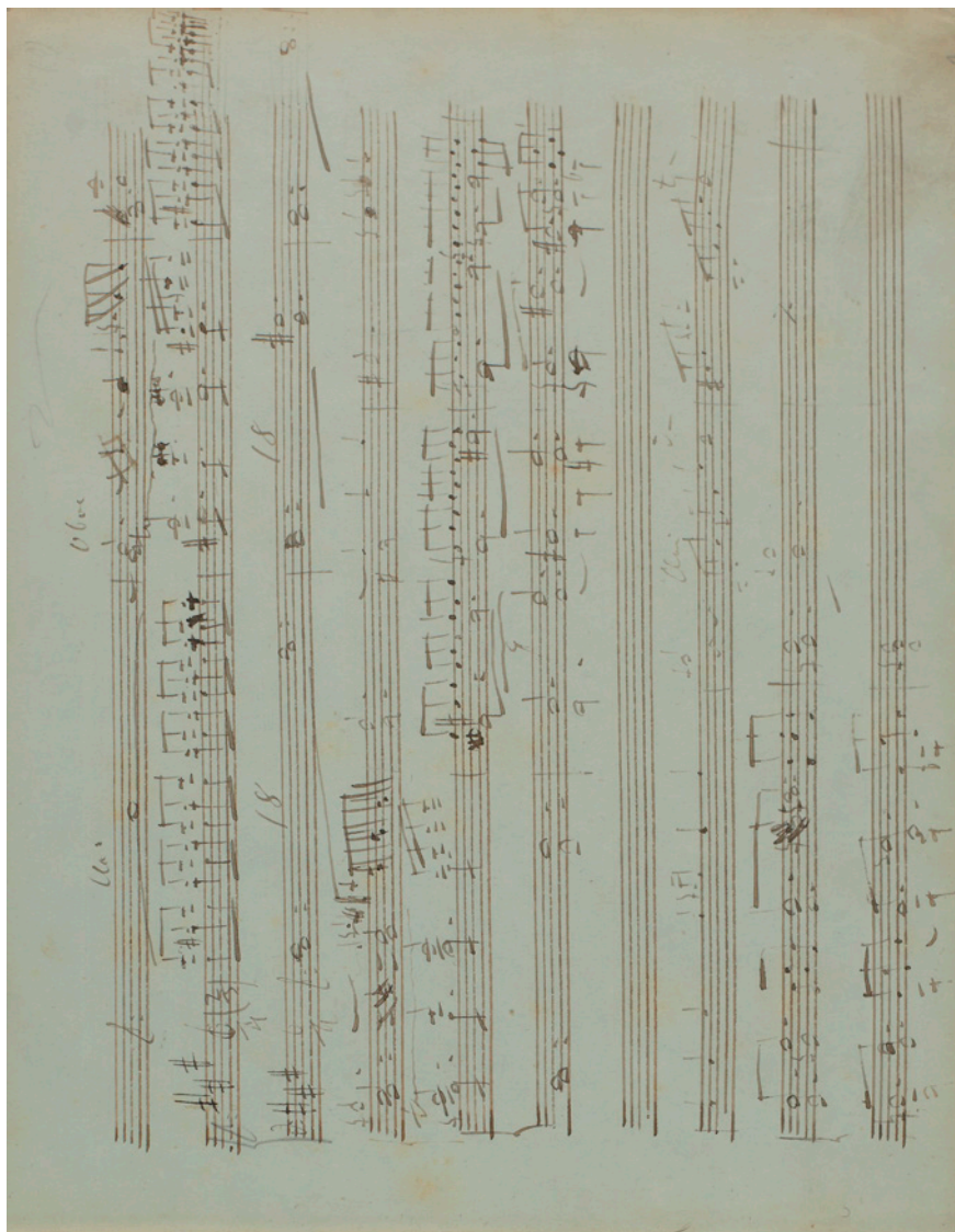
Figure 5b. The first page of Liszt's draft for Sardanapalo , c.1850, written in a score format similar to that in Figure 5a, and showing similar instrumentation cues. GSA 60/N4, fol. 2r.