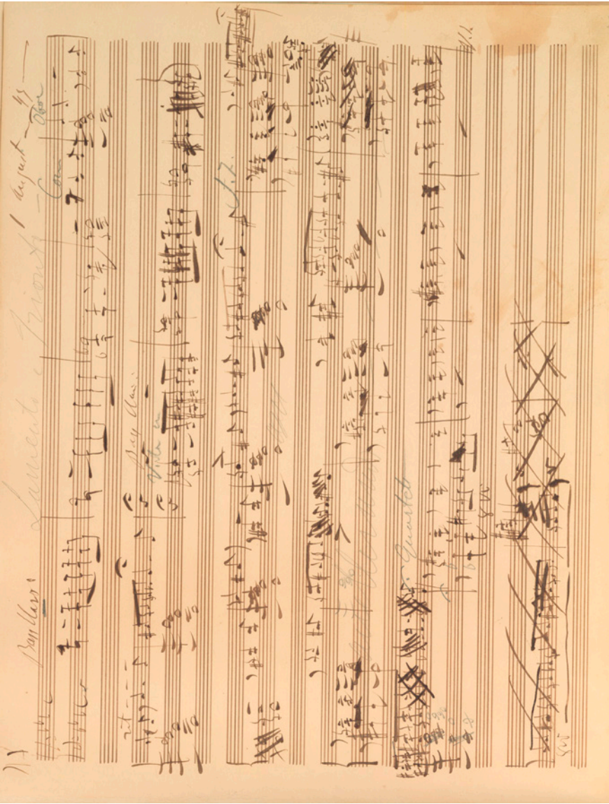
Figure 5a. Liszt's first draft of Tasso: Lamento e trionfo , dated 1847, written in score format playable at the keyboard, and showing instrumentation cues. GSA 60/N5, fol. 28r.