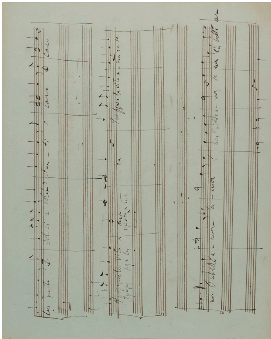
Figure 1. Liszt's autograph MS N4, pp. 70–1, showing the musical 'gaps' in his notation of Sardanapalo (GSA 60/N4) for bars 700–29.