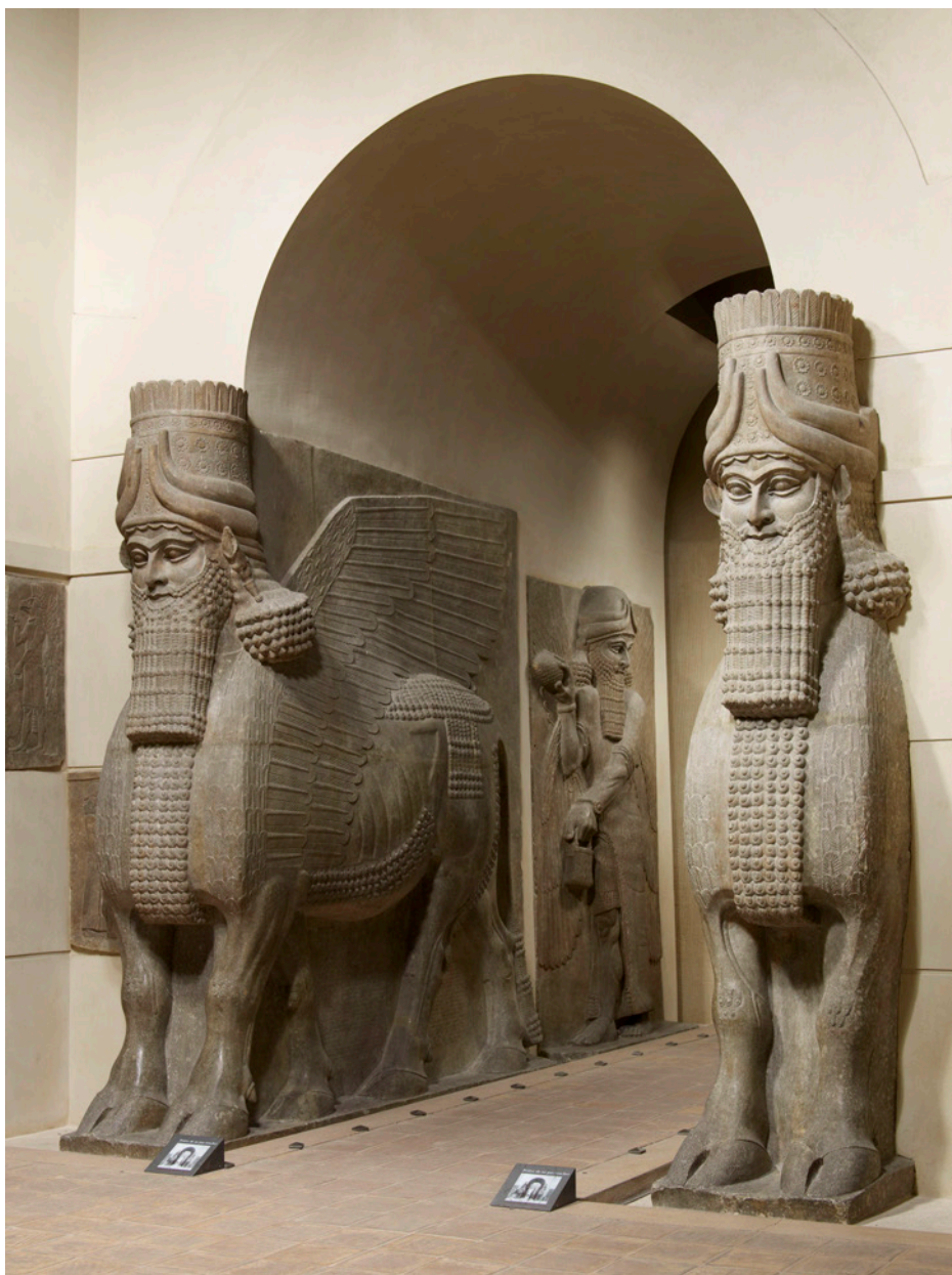
Figure 3. Assyrian shedû or lamassu , winged bulls who guard gateways, relocated from northern Iraq to museums in London and Paris during the 1850s.