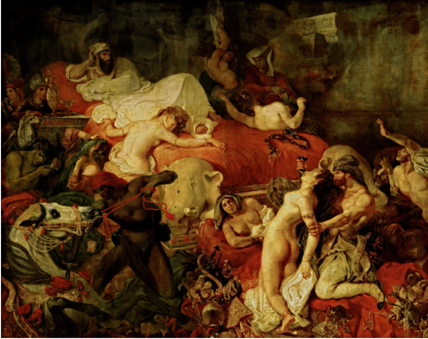
Figure 2. Eugène Delacroix, La mort de Sardanapale (1827–8).

actions of the Eastern monarch upon learning that his kingdom has been sacked: he witnesses the destruction of all that is dear to him – a bonfire of the vanities – including his concubines, slaves, pets and stud of horses; all in preparation for his famed, opiate-fuelled self-immolation, or, as Byron puts it, ‘a leap through flame into the future’ whose excruciating pain would serve as a historic act of defiance: