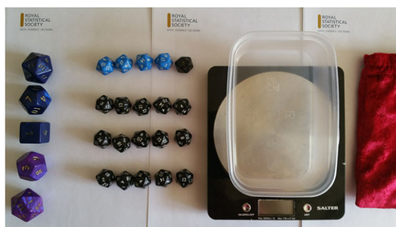
Fig. 1. Example of required materials: 25 objects, a weighing scale and a draw bag. Note that we have small/large and blue/not-blue objects. [Colour figure can be viewed at wileyonlinelibrary.com ]

Explain that the trivial solution to weigh all the objects is often not possible. Instead, if we knew the mean weight of an object, we could calculate the weight of the bag as 25 times the mean weight. Hence, the weight of the bag is equivalent to knowing the mean object weight. There is no prior knowledge about the objects, so we will take a sample of objects and use these to estimate the population mean object weight; here, we introduce the concept of a sample mean (or fully, the sample mean weight).