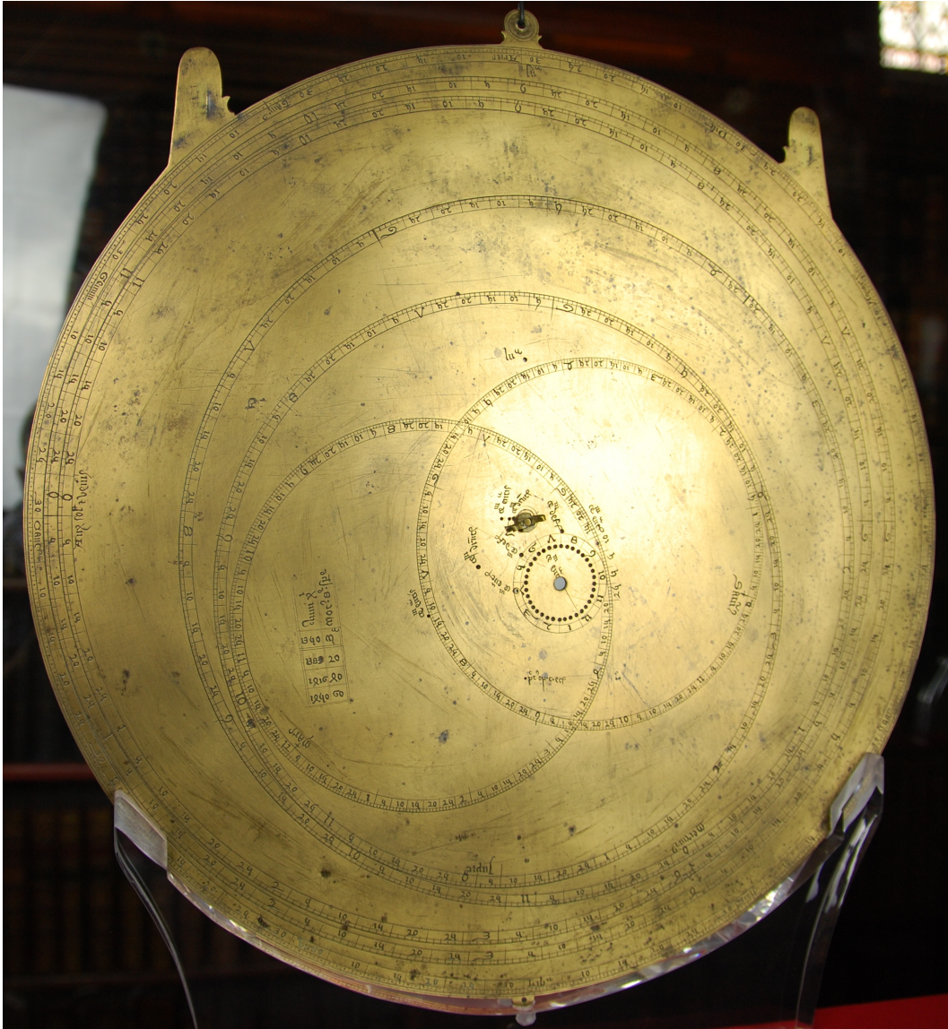
Figure 1: Back of Merton astrolabe-equatorium, c. 1350 (Merton SC/OB/AST/2).