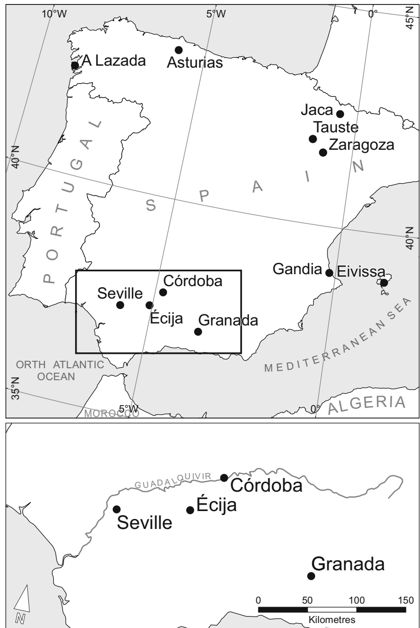
Fig. 1 Map locating Écija in comparison to Seville, Granada and Córdoba