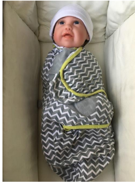
Image 1. The life-like baby doll in the crying baby paradigm