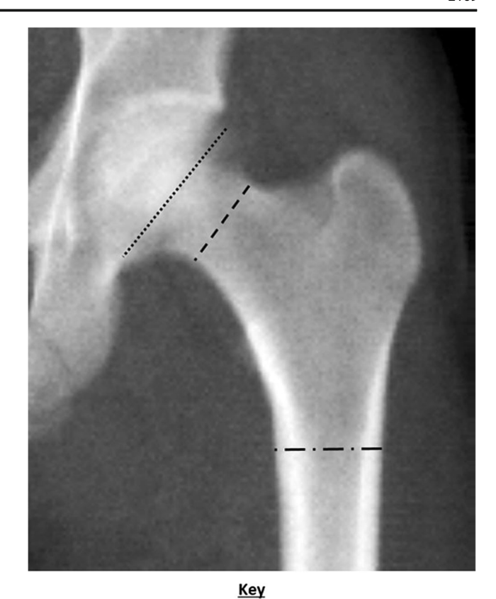
Fig. 1 Example of a hip DXA scan showing measurements collected in this study

The repeatability of the DXA measurements (intra- and inter-observer error) were assessed using the technical error of measurement (TEM) and the coefficient of reliability ( R ), calculated following Ulijaszek and Lourie (1994). We also calculated TEM as a percentage of the mean for that measurement (%TEM). Inter-observer error was calculated from all