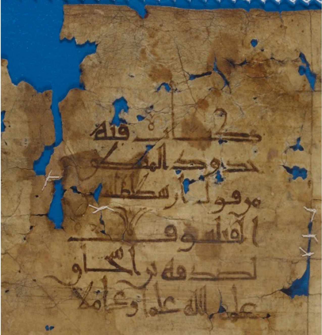
Title page of the Kitāb ḥudūd al-manṭiq in an Abbasid bookhand, T-S K6.181,r.

The 28 lines of the verso, containing the beginning of the Judaeo-Arabic text, are written in a formal Hebrew square script. The Judaeo-Arabic orthography shows some hallmarks of Early Phonetic Judaeo-Arabic Script (EPJS), which dropped out of use in the tenth century. All in all, the evidence points to an early date for this copy, probably the tenth century.