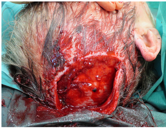
Fig. 1. Extent of scalp laceration evident following irrigation.

Computed tomography (CT) of the chest and abdomen showed multiple rib and vertebrae fractures. Cranial CT revealed a posterior soft tissue injury with no skeletal or intracranial involvement.