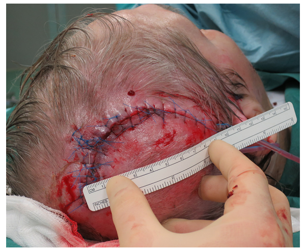
Fig. 2. Laceration following primary closure. Note the friable edges, particularly posteriorly.

Due to the patient's T8 fracture, it was decided that a log roll was contraindicated, thus limiting the clinical examination. Further