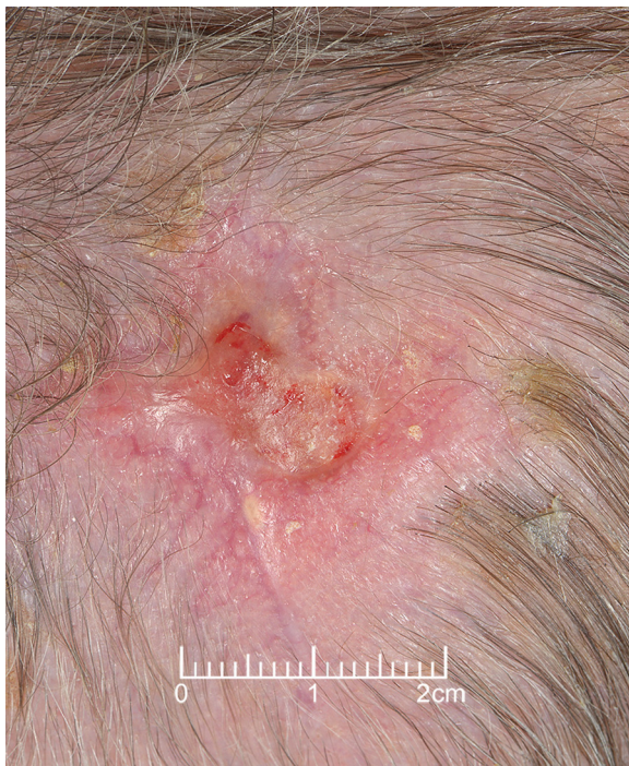
Fig. 4. Lesion on last review, following application of topical corticosteroid cream.

other cause of medical collapse indicates that the fall, itself, was most probably a mechanical fall due to the patient's pre-existing reduced mobility.