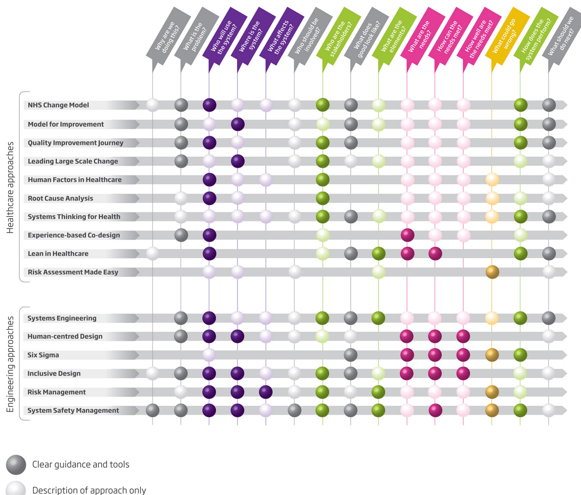
Figure 2 The ability of both engineering and traditional approaches to healthcare improvement to answer the key questions of a systems approach.

techniques it has developed provide powerful insights into the planning and implementation of interventions to complex systems, and incorporating these into a wider systems approach may be of enormous benefit to clinicians and academics seeking to address global health challenges.