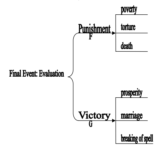
Figure 4 Semantic attributes of Final Event

When it comes to the Final Event, fairy tales give Evaluation realized by two semantic attributes including Punishment (F) and Victory (G). Two conditions will come out: (1) the integration of both Punishment and Victory; (2) the occurrence of either Punishment or Victory.