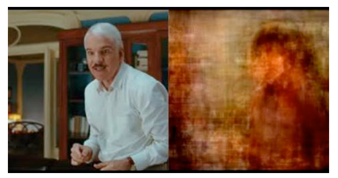
Figure 1. A visual image reconstructed from brain activity, as reported in [27]. The left side of the figure shows a film scene presented to an experimental subject. The right side is a reconstructed image informed by EEG measurements from the subject's brain.

My case study comes from the work of Jack Gallant's research group, described as 'reconstructing visual experiences from brain activity' [27]. Generating wide public interest from the disturbing suggestion that his team had created a mind-reading machine, this ML system retrieved film clips from a database according to the similarity of EEG readings taken while people watched the films. Press reports and publications were accompanied by images such as that in Fig. 1, showing (on the left) a still from the film that had been shown to an experimental subject, together with (on the right) a 'mind-reading' result that was often interpreted as the rendering of an image captured from within the brain of the subject.