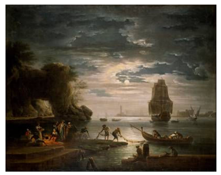
Coastal Scene (La Nuit) C.J. Vernet The Ashmolean Museum

Whilst this does not make for comparable experiences for the trainees, it provides both fertile ground for partnerships to mature and develop and takes steps towards establishing new partnerships.