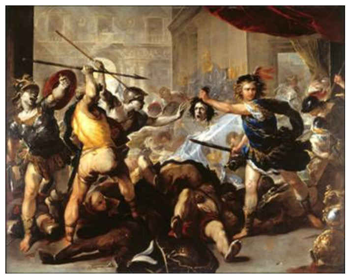
Perseus turning Phineas to stone Luca Giordano The National Gallery

manifest in the short term, but that they have endured beyond the duration of the students' courses.