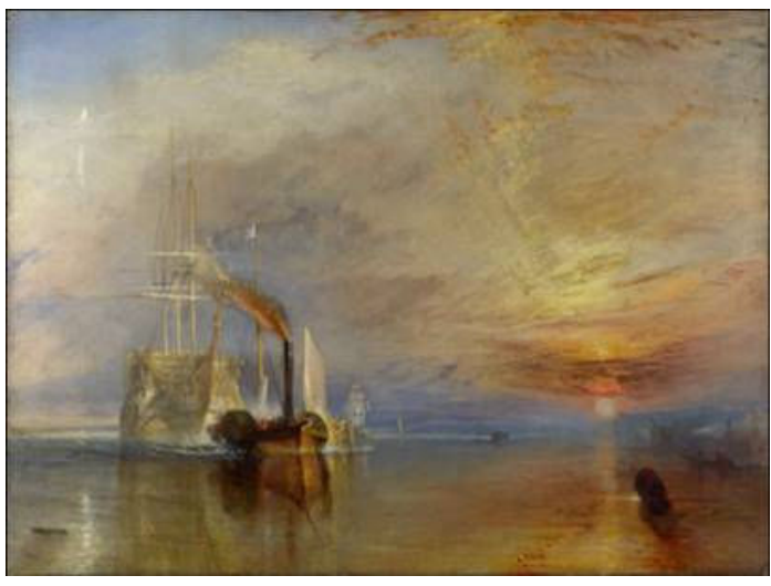
The Fighting Temeraire J.M.W. Turner The National Gallery

The sense of risk felt by the participants illustrates the extent of the departure taken from their 'normal' teaching. The reported effects suggest that this change of approach had a positive impact.