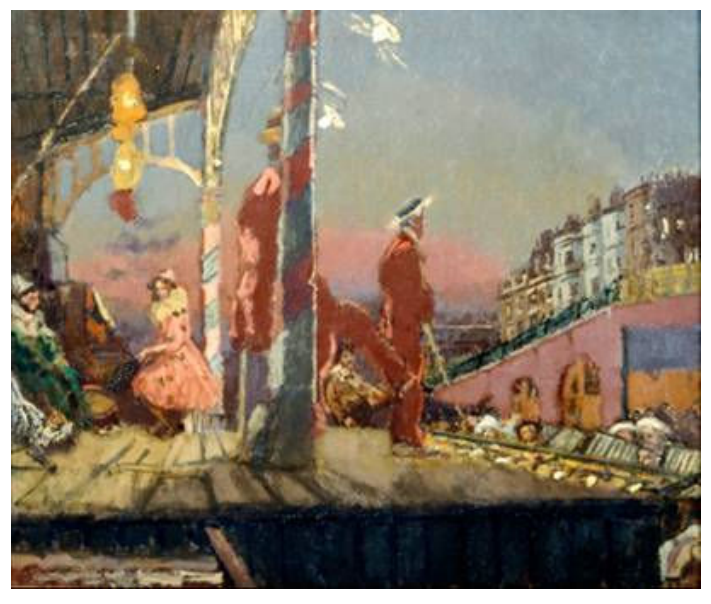
Brighton Pierrots W.R. Sickert The Ashmolean Museum

Whilst students and teachers focused heavily on the cross-curricular aspect of the Cultural Placement Partnership, participants indicated that they did so with learning objectives in mind.