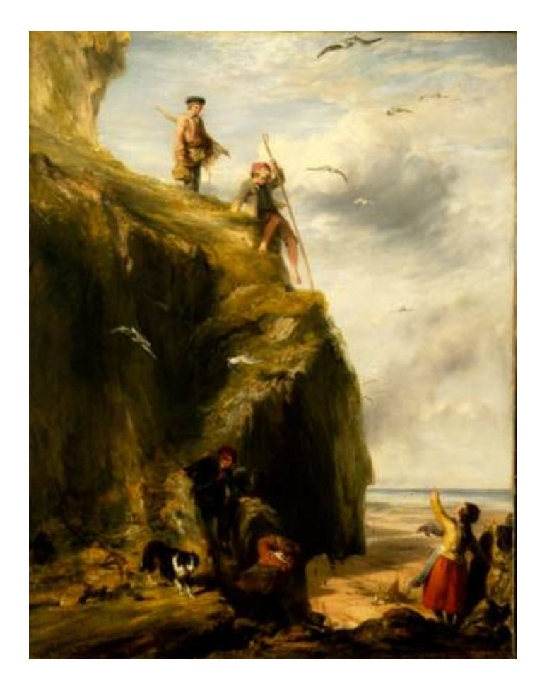
Returning from the Haunts of the Seafowl William Collins The Walker Gallery

Ultimately, the degree to which the initial premise of the Cultural Placement Partnership has evolved and moulded to the different needs of the different regional partnerships can be seen as an indication of its sustainability.