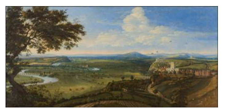
Nottingham from the East Jan Seberechts Nottingham Castle Museum

Whilst the lack of museum/gallery visit means that the overall experience would be to some extent compromised for pupils and their teachers, this confidence that a Take One Picture approach can still work in such a situation indicates both this student's determination to use the ideas and also the remote availability of museum and gallery resources facilitated by the Partnerships.