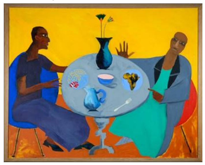
Five Lubaina Himid Leeds Art Gallery

A remarkable level of excitement about the use of paintings to support innovative teaching was evident from the nearly all of the participants. Some fundamentally important educational aspirations were being addressed as part of the work. In particular, cross-curricular teaching was being used in ways that acknowledged the limitations of tangential topic links, and hence was building on developments in educational practice over a twenty year period. Perhaps even more important than this was the evidence that pedagogical risk-taking was positively changing the ideas not only of the trainees themselves but also of experienced teachers that the trainees were working with.