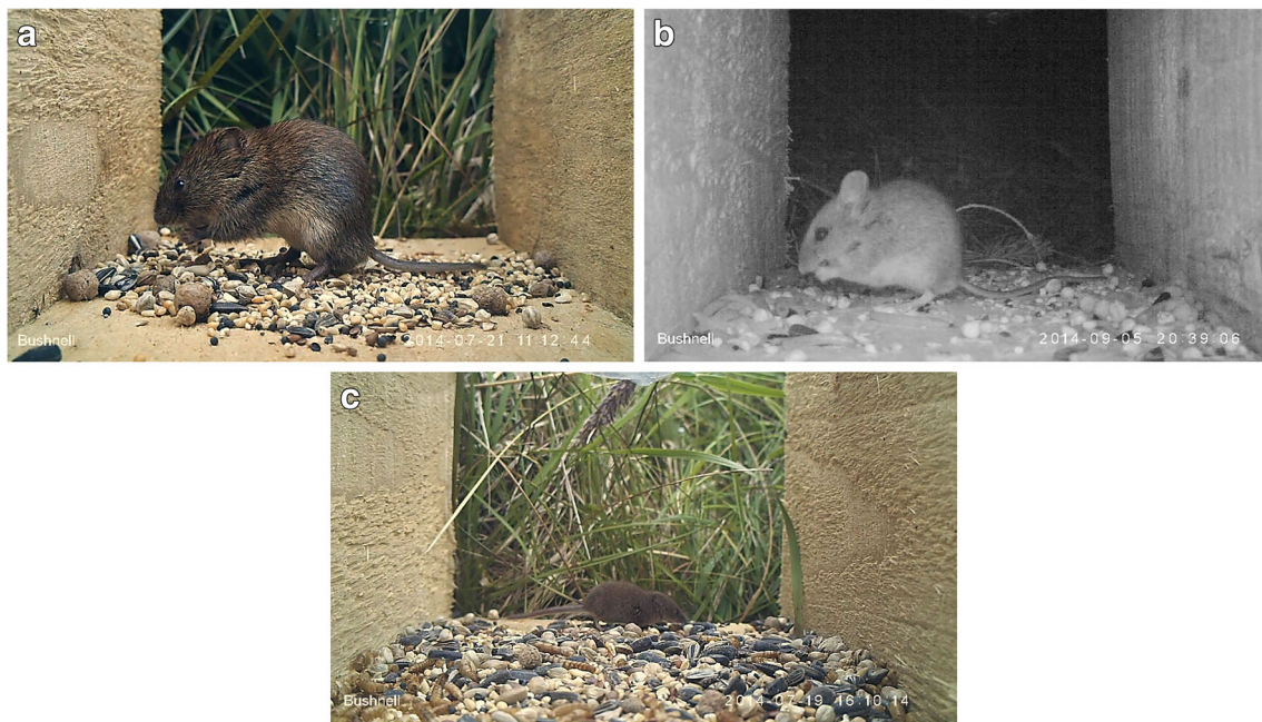
Fig. 2 Example screenshot from video footage. a Bank vole. b Wood mouse. c Pygmy shrew

and were orientated randomly in bog sites. Locations were surveyed in groups of three trap sets (one in each habitat) simultaneously, this being referred to as an ‘episode’. Survey locations were selected from a pool of pre-defined locations that were stratified to be spread across the site but with precise locations generated randomly. Generally, survey locations along the same access route were selected for each episode, to minimise travel, though locations surveyed simultaneously were at least 168 m apart. Thus, nine camera traps (randomly selected for each placement from an overall pool of 11 camera traps) were in use at any one time. Each tunnel was baited, set in position between 3 pm and 9 pm, and then retrieved, 2 days later, between 12 pm and 6 pm.