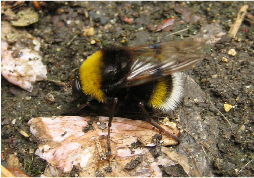
FIGURE 1 Pocota personata , Abney Park, Stoke Newington, London (2013).

Pocota personata is associated with old trees, where its larvae can develop in so-called “rot holes” after fallen branches have left behind a distinctive micro habitat. The term saproxylic, derived from the Greek σαπρός (saprós) meaning “putrid,” refers to organisms that depend on ecological niches derived from damaged or hollow trees, rotten wood, and their associated fungi. In the UK alone, more than 1,500 species of beetles and flies are dependent on saproxylic habitats, and many of these species are rare or highly restricted in their distribution. Although the conservation value of saproxylic habitats is now recognised internationally as one of the most distinctive features of woodland ecology very few sites enjoy some form of legal protection in the UK or elsewhere on the basis of their saproxylic fauna alone. 8