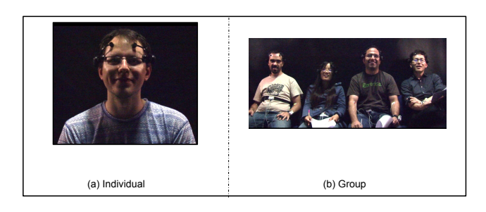
Figure 3: The setup for individual and group data acquisition. In individual settings, each participant watched the movie stimuli alone, while in group settings, a group of four participants watched the movie stimuli together.

to the extracted descriptors, vQLZM. The number of Gaussians is set to K=256 and a subset of 256000 descriptors is randomly sampled to fit a GMM. Subsequently, each clip is represented by a (2D+1)K dimensional Fisher Vector, where D is the dimensionality of the descriptor after performing PCA. In this way, we obtained Fisher Vectors from vQLZM (vQLZM-FV).