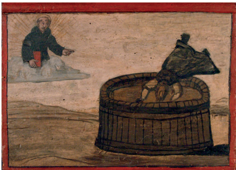
3. Girl falls into a barrel, sixteenth century. Tempera on panel. By kind permission of the Museum of San Nicola, Tolentino.

More information has come to light regarding the production of wax ex-votos. At the high end of the market, in Florence, the Benintendi family (also known as Fallimagini or 'image-makers') was renowned for supplying full-size votive effigies to patrons of the shrine of the Santissima Annunziata. 17 When the Madonna of the Oak at Viterbo shot to fame in 1468, the sacristans who supervised the shrine first employed the Ciffarelli family to provide wax votives. But once the Dominican fathers of the congregation of San Marco had taken charge of the shrine, at the start of the sixteenth century, they invited members of the Benintendi family to come from Florence to run the workshop; they remained in business there until 1609. 18 In the case of Lonigo, we know that the Olivetan monks who had custody of the shrine presided over two workshops 'for the sale of candles, statues, and other wax items'. 19 Pharmacies also purveyed large quantities of wax for use in votive