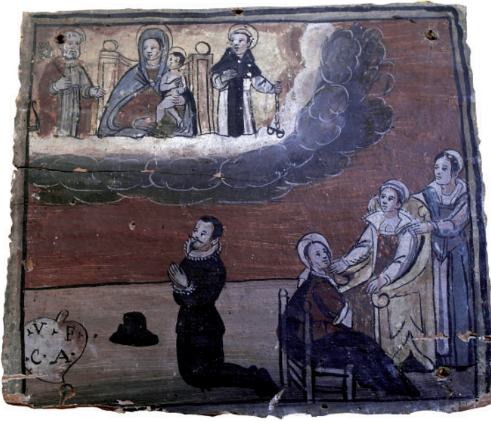
2. Woman in childbirth, late sixteenth century. Tempera on panel. By kind permission of the Sanctuary of Madonna dell' Arco.

signed by their makers. 14 Nor were they generally listed in account books, family archives and workshop records. 15 Transactions between the producers and consumers of painted ex-votos are therefore frustratingly invisible, so that we know very little about (for example) the relationship between images that were commissioned individually and those that were bought 'off the peg'. The canon of Italian artists established by the sixteenth-century art critic Giorgio Vasari scarcely seems relevant to the subculture of votive tablets, objects which did not owe their value and meaning to the artist's name but which were infused with personal and devotional significance. 16