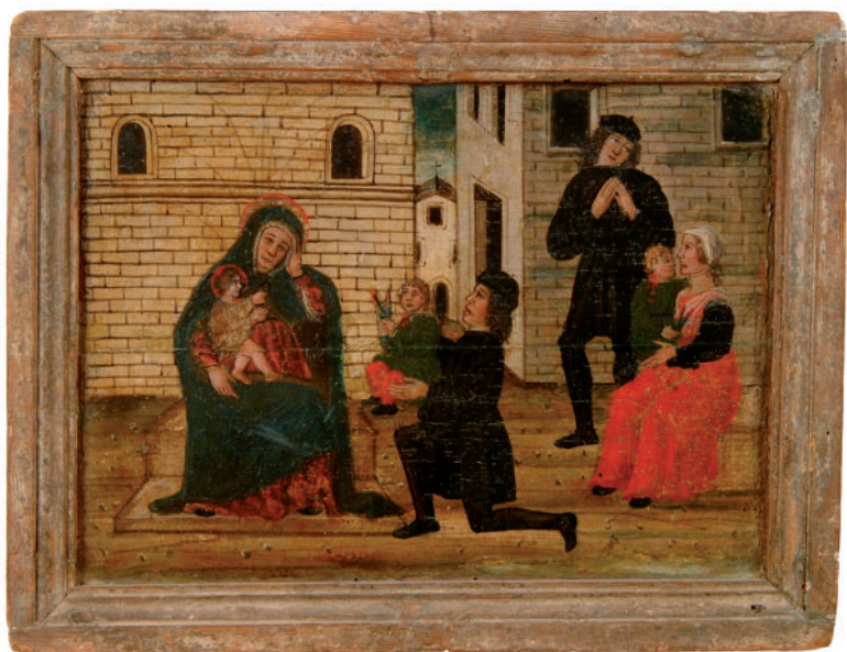
1. Boy wounded by scissors, late fifteenth century. Tempera on panel. By kind permission of the Sanctuary of Madonna dei Miracoli, Lonigo.

artists and their assistants? Did they provide bread-and-butter income to painters awaiting more substantial commissions for altarpieces and portraits? Or were there specialized craft workshops dedicated to the production of these images? Our lack of answers to these questions in part reflects the priorities of art historical research. The intensive effort that is required to establish elusive attributions has not as yet been lavished on The Girl in the Barrel or the Toddler with the Scissor Wound . 13 Painted ex-votos pose particular problems of attribution. In the first place, the tablets themselves were not