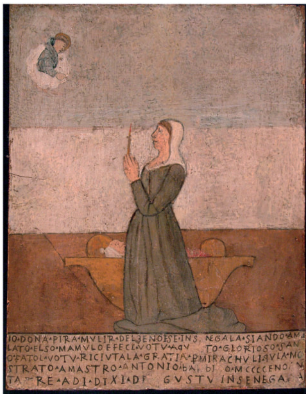
4. Ex-voto given by Donna Pira, 1493. Tempera on panel.

places of origin. This contrasts markedly with anatomical votives (it is impossible to tell one wax leg from another) although, as will be seen, there is some evidence to suggest that three-dimensional ex-votos could have accompanying inscriptions and other methods of personalization in this period. The ability to identify specific people experiencing specific miracles is one of the defining strengths of the painted votive tablet. Even in cases where no text was supplied — as with the child injured by scissors or the girl falling head first into a wine barrel — the specificity of the incident would have allowed individuals and wider communities to identify the characters who were represented. On the other hand, serially produced painted tablets representing men, women and children in their sick beds often included a blank cartouche in which the miracolato or beneficiary of a miracle could insert his or her