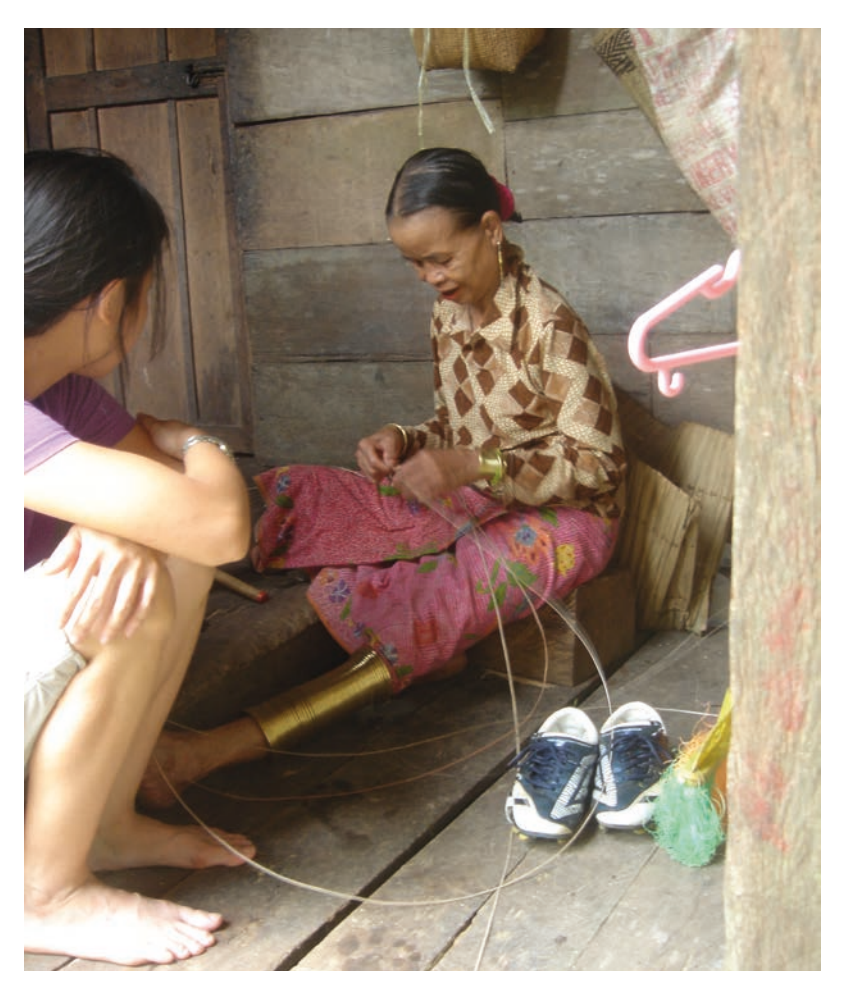
Figure 8: An ethnographer watching and talking to an elderly lady as she prepares rattan for weaving into a basket.