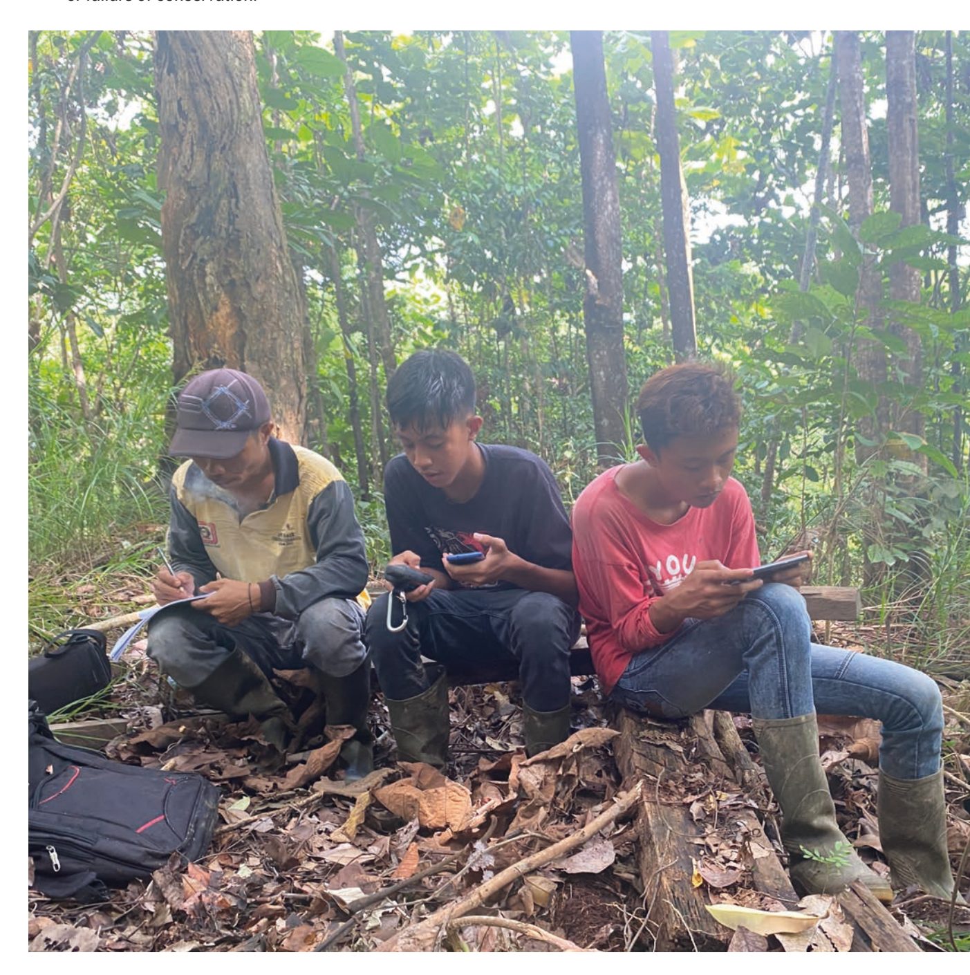
Figure 5: A group of villagers write down their observations during a routine patrol of a village forest

Look beyond the immediate context: Often, the most interesting findings stem from encounters, conversations, and things that seem to have nothing to do with the original subject matter. As the next chapter explains, keeping your research and programme design openended and flexible allows you to look beyond the immediate context and engage with the messy and unexpected elements of people's lives, including factors that may ultimately end up determining the success or failure of conservation.