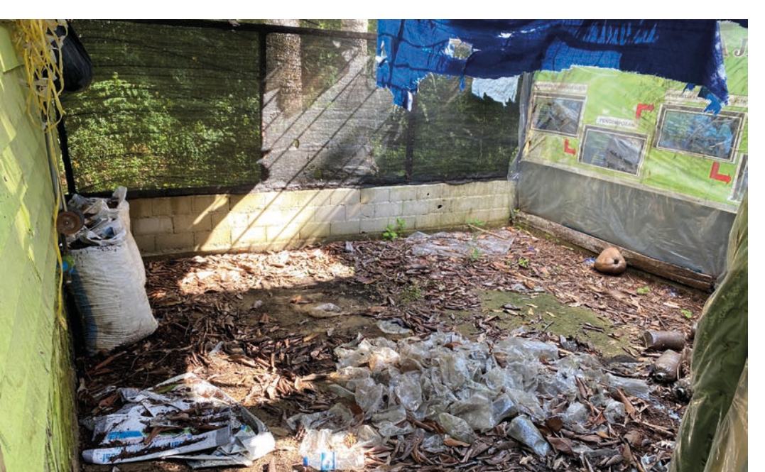
Figure 2: Ragged tarpaulin sheets, a banner with fading text, and empty plastic bags mark the location of a completed sustainable livelihoods project.

When approaching a new area, it is thus important to find out about any previous conservation/NGO/development work in the area, what relations and perceptions this created, and how best to build on or depart from such work (see Figure 2). For example, if villagers in a certain area had negative experiences with conservation schemes that restricted access to their land, it is vital to address those concerns first and ensure that the same mistakes are not repeated. It is also important to consider how gender, class, ethnicity, or religion influence who is participating (or not) in externally introduced activities. For instance, rejecting a meal offered by villagers because of religious concerns can be seen as an offence against their hospitality and create distance between local people and visiting conservation staff.