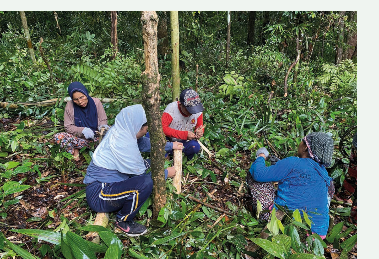
Figure 4: During a break in their forest-clearing activity, swidden farmers are gathering plant material to prepare for a ritual.

Through her immersion in local everyday life, Researcher A gained important insights into local beliefs, moralities, and concepts of health and well-being, and other concerns that would have been hard to capture through interviews or surveys. From these, she realised that the villagers did not consider the training and workshops offered by the organisation to be adequate returns for their hospitality, but, rather, hoped for concrete material contributions to the local infrastructure. From the villagers' perspective, the NGO had obviously violated local forms and expectations of reciprocity, which in this case also involved requesting permission from spirits through ritual offerings. Instead of investing in another conservation activity, Researcher A learned that conservation organisations should take the time and effort to learn about villagers' preferences so as to adequately respond to local needs and expectations — even if these were not directly linked to conservation goals.