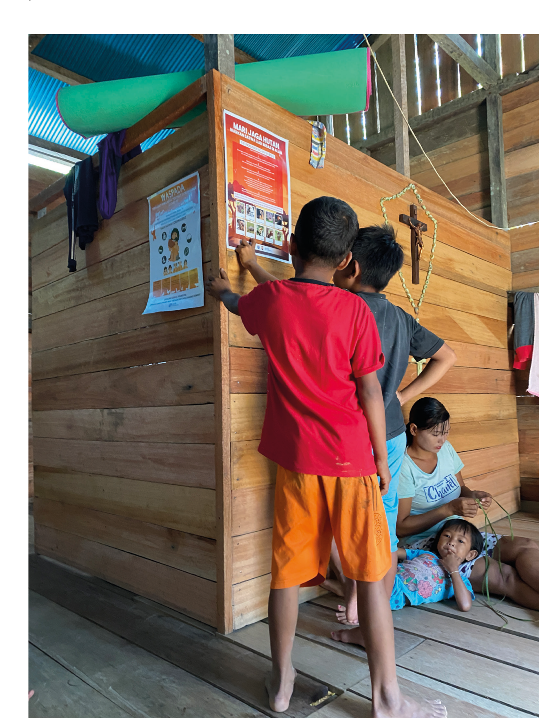
Figure 1: Children inspect a recently distributed poster about nature conservation.

In the next chapter, we outline some considerations and guiding principles for conservationists seeking to build up long-term relations of trust and respect with local communities, which can help mitigate some of the problems identified above.