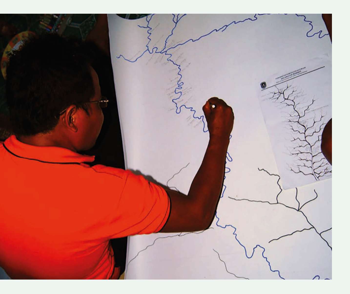
Figure 10: Villagers draw a map of their ancestral lands.

Researcher A has official maps that indicate the extent and boundaries of a proposed village forest. However, she also wants to understand how these relate to customary land ownership and forest rights in the local area. She thus asks a selection of villagers to draw rough maps of their customary lands (see Figure 10), and follows up by walking through these lands with the same individuals. Through these, she discovers the full extent of the villagers' customary land holdings, learns about traditional methods of boundary-making (e.g. by planting certain types of bamboo or following ridges and streams), and realises that the boundaries of the proposed community forest cut through some of the villagers' customary lands. Based on this new knowledge, Researcher A initiates further community research into individual households' customary land holdings, and uses this to design a community-oriented map that more clearly identifies the boundaries of the new community forest with reference to local landmarks and boundaries and named individuals' land.