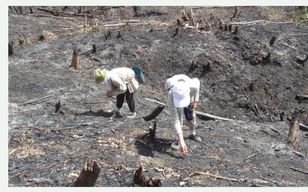
Figure 13: An ethnographer sowing rice and vegetable seeds on a newly cleared hillside with her village hosts. Although governments and NGOs often see traditional practices of rice planting as an indicator of poverty, they are an important source of wellbeing for many practitioners.

This example shows the potential value of being present for unexpected events and taking an interest in them – a central aspect of ethnographic fieldwork. It also shows the importance of putting time and effort in analysis and reporting. A simple description of how a village community reacts to a specific policy may not be of obvious value to conservationists. However, by going over the data, Researcher Z hit upon the question of how to explain certain contradictions in it. This led to a report on multiple local conceptions of poverty which clearly had important implications for conservation work in the region, for example for how to approach benefit-sharing schemes.