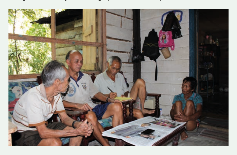
Figure 9: An interview on local histories with village elders.