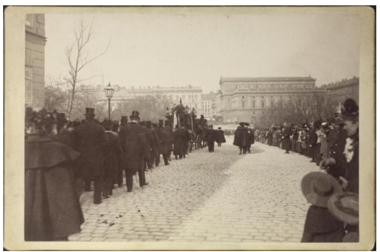
Figure 5: Johannes Brahms's cortege from Karlsgasse to Lothringerstraße (June 6, 1897); by courtesy of Österreichische Nationalbibliothek, Bildarchiv Austria

In "Beethoven's Ninth Symphony: The Sense of an Ending" Maynard Solomon argued that Beethoven's capacity for endless metamorphosis—just as much a feature of Brahms's compositional process, of course, as of Beethoven's—"runs the danger of yielding to the chaotic; it defeats form, and makes endings improbable, for it will not accept any ultimate resting-place, or any implication of finality."<sup>[25]</sup> There's more than a hint of this phenomenon in several of the works considered here, not least the Vier ernste Gesänge . Brahms's spirals—or circles—repeatedly invoke the idea of unfinished business. After all, the completion of one rotation, to hijack James Webster's term, does not preclude the possibility of further travel.