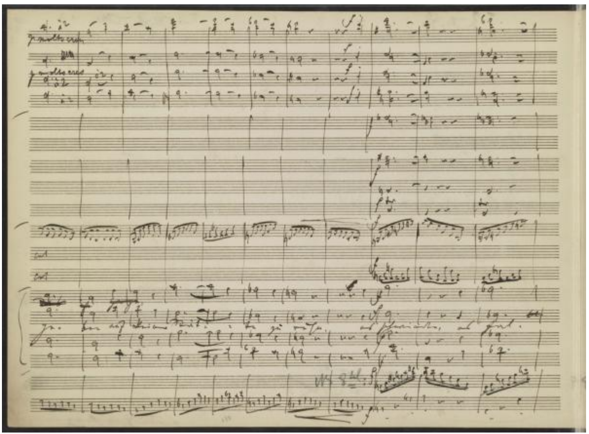
Figure 2: Johannes Brahms, Schicksalslied (Op. 54, 1871), autograph (p. 26); by courtesy of Library of Congress, Music Division ML96 .B68 Case

Most interpretations of the Schicksalslied are strongly colored by the available documentary evidence. In this case, we possess unusually rich material about Brahms's compositional process. Correspondence with Hermann Levi and Carl Reinthaler reveals a composer uncertain how to respond to the grim outcome of Hölderlin's poem. The poet contrasts the beatific existence of the gods, bathed in heavenly breezes, with the travails of humankind, whose lot on earth affords no certainties. Hölderlin ends in despair with a description of mortals plunging from cliffs into unmeasured depths. Faced with this deeply pessimistic image, Brahms decided ultimately to translate the two sections of Hölderlin's poem into a piece of music in ABA' form where the A' section, as we have seen, is a transfigured, textless version of the opening. Inevitably, perhaps, the composer's uncertainty over how to respond to Hölderlin's denouement has dominated hermeneutic approaches ever since. One can't help wondering whether the reception of the Schicksalslied would have been rather different—more Schumann-centered?—if history had failed to provide this unusually helpful biographical perspective.