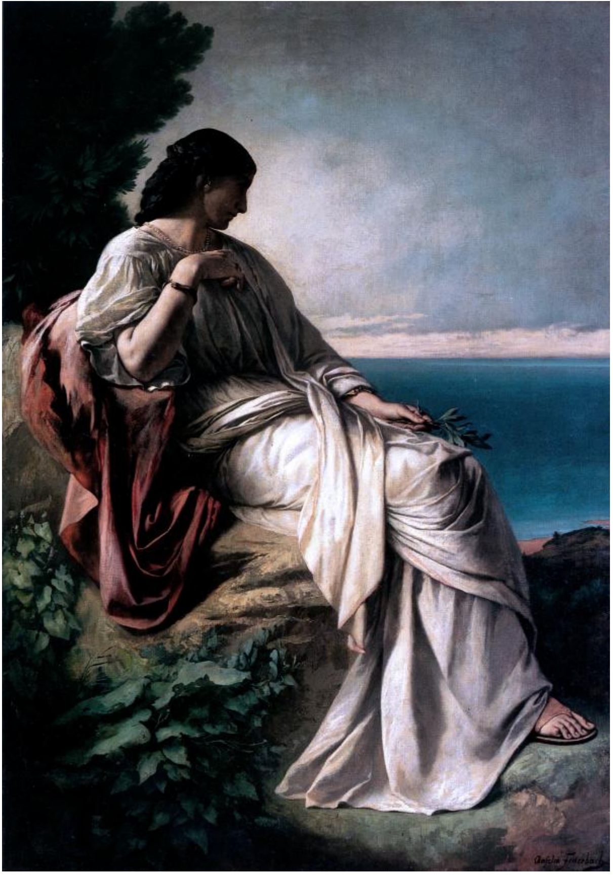
Figure 4: Anselm Feuerbach, Iphigenie (1862); photo and courtesy of Hessisches Landesmuseum Darmstadt

In dealing with the Gesang der Parzen , Grimes turns on its head the procedure she adopted for the Schicksalslied . There, critics were taken to task for failing to consider the broader context—that is to say, Hölderlin's novel. Here, Grimes argues that a satisfactory interpretation can be reached only by laying to one side Goethe's play. At first glance, the change of approach