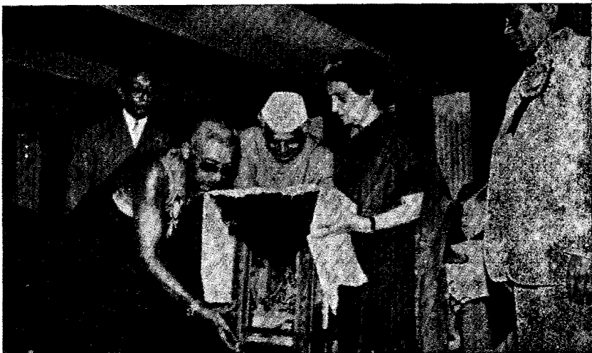
The Governor presenting the bronze image of Guru Padma Sambhava to the Prime Minister. Shri N. B. Bhandari, Chief Minister of Sikkim is looking on.