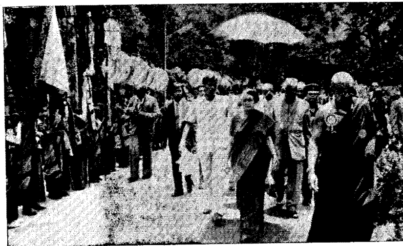
Prime Minister being taken in procession by lamas in traditional colourful costumes and music of trumpet to the shamiana for the main function.