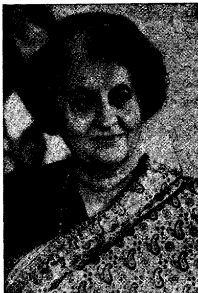
PRIME MINISTER INAUGURATES THE SILVER JUBILEE