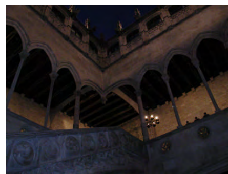
Generalitat de Catalunya

As the wording of the declaration states, the Foundation is a charity and must be able to prove the work it supports is of public benefit. The declaration also requires you to provide the Foundation with a list of recommendations for further monitoring and work on the language that is the subject of the application. This material will serve both to support the current application in the selection process, and also to provide the Foundation with arguments in their quest for further funds to supplement existing projects in the future.