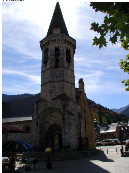
Era Glèisa de Vielha, Val d’Aran

The fact that Val d’Aran implied one night away from Barcelona may have dissuaded some people from registering. Still, the deal agreed with Hotel Turin – whereby the party was away for one night in the midst of their stay – was a good one. This should be taken account of in new conferences in the future. Actually, the only inconvenience was either the narrowness of streets in the small village (Bordes), the size of the bus’s horns and their volume.