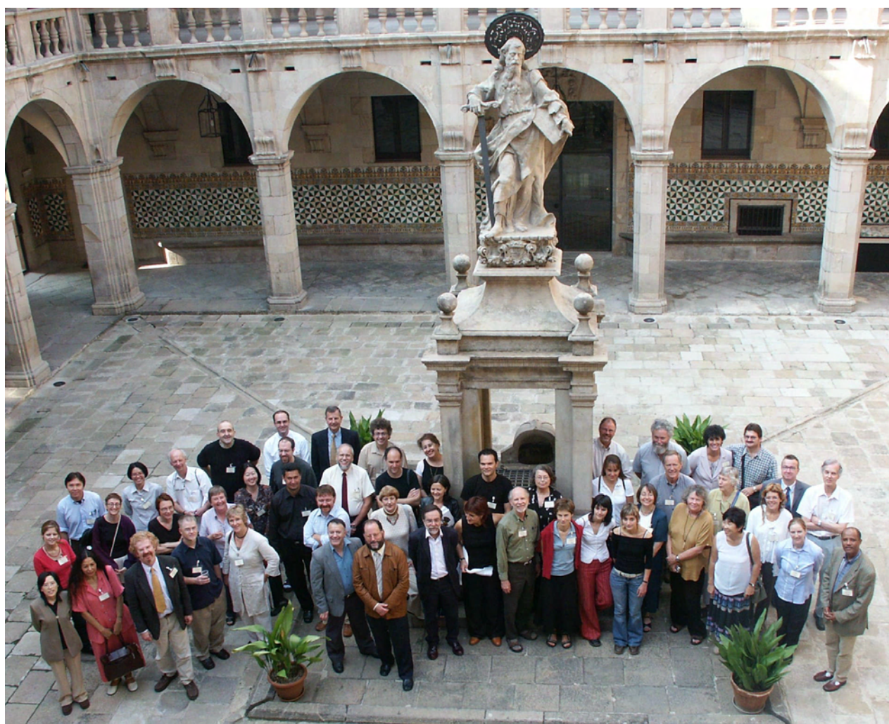
FEL VIII: Conference Group Photograph