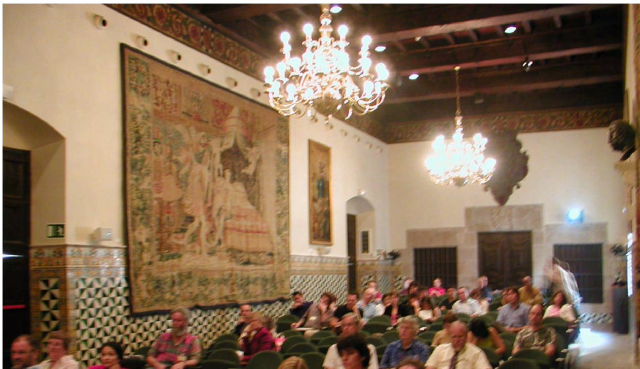
A View of FEL VIII in Session at Institut d'Estudis Catalans