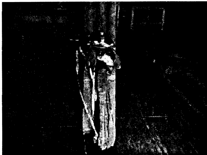
Figure 1. The helmet and sword of the Bhutanese general killed by Karma dar rgyas. The sword and helmet were taken as a trophy to g.Yang thang where they are still preserved by D.N. Tarkapa.