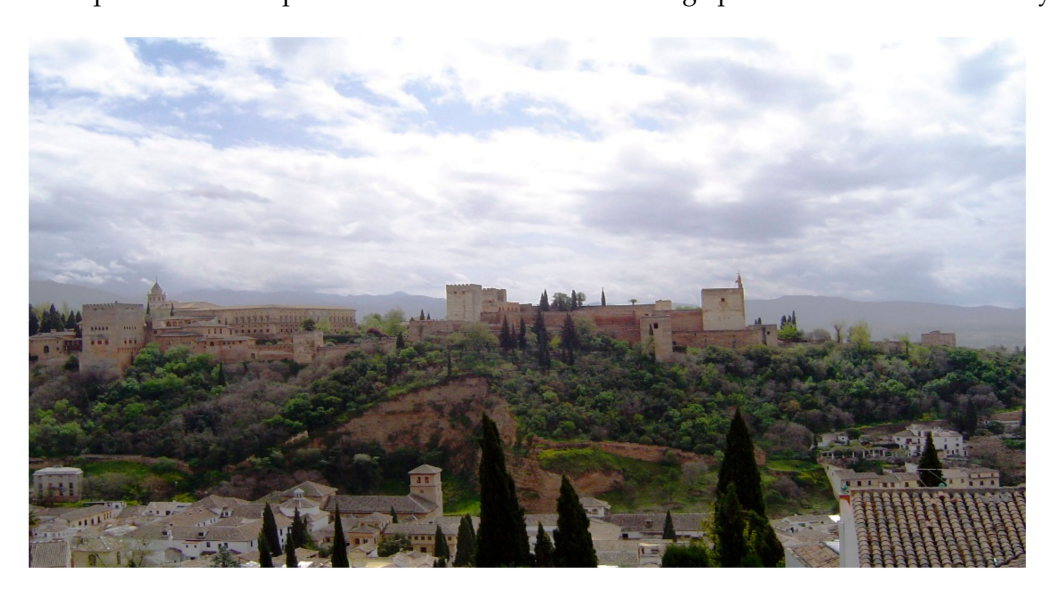
Figure 1. The Alhambra, Granada, viewed from the Sacromonte.

defeated Mohammed XI, Boabdil, last Nasrid sultan of Granada, thereby ending 800 years of Muslim rule in Spain. The Nasrids had established Granada as their capital city in 1237, where they created an exclusively Arabic-speaking, Islamic state at the farthest outpost of western Europe which lasted for over 250 years until 2 January 1492, when it became part of the Christian kingdoms of Spain. The city marked the confluence of two civilizations, but in a context of maximum discord between them, hence my contention that Granada is a site of unique historical importance in the debate surrounding Spain's cross-cultural identity.