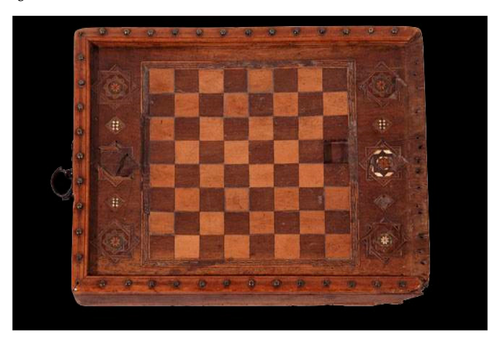
Figure 2. Nasrid chessboard, Museum of the Alhambra.

The question of Nasrid Granada's contribution to the culture of Andalusia and the late medieval Mediterranean can be answered in part by a snapshot of just three of the many aspects of Nasrid cultural innovation that benefited the Mediterranean area, namely trade, civil engineering and architecture. The technique of taracea used in the Alhambra chessboard is a clear example of the long cultural reach of Nasrid artisan crafts, as their ancient marquetry skills are still used today in two cities, Granada and Damascus. Luxury items made using marquetry were part of a broader range of crafts, such as leatherwork,