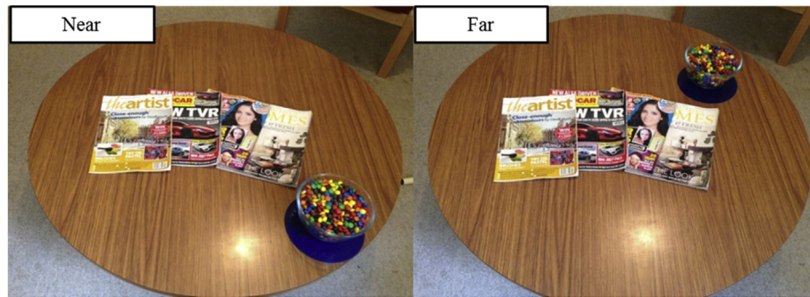
Fig. 3. Snack presentation in each distance condition.