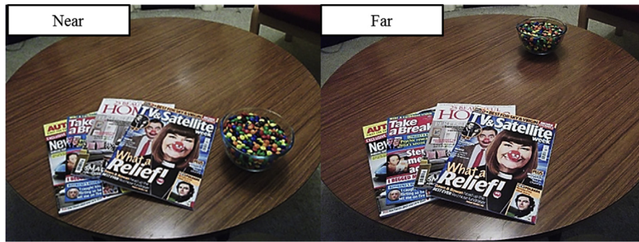
Fig. 2. Snack presentation in each distance condition.

the bowl undermined fidelity of the study protocol. Any bowl manipulation by the participant was recorded and considered in the analysis.