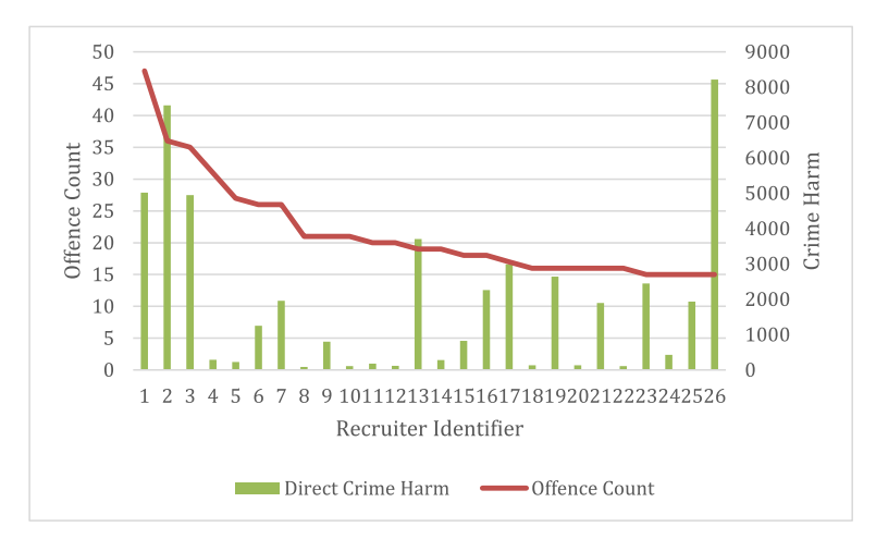
Fig. 1 Recruiter direct crime harm total by offence count over 5 years

Of particular note in Fig. 1 is that recruiter 26 is linked to the least number of crimes (15) yet has the highest attributable crime harm (8220 days). Recruiters 26 and 8 both match our definition of recruiters yet are linked to crimes with crime harm of 8220 and 84, respectively. This represents a difference of 97 times. Thus using the Cambridge crime harm index has revealed that targeting recruiter 26 would reduce the harm to society by 97 more times than recruiter 8 , yet a pure crime count analysis would suggest that recruiter 8 would actually be a more appropriate target.