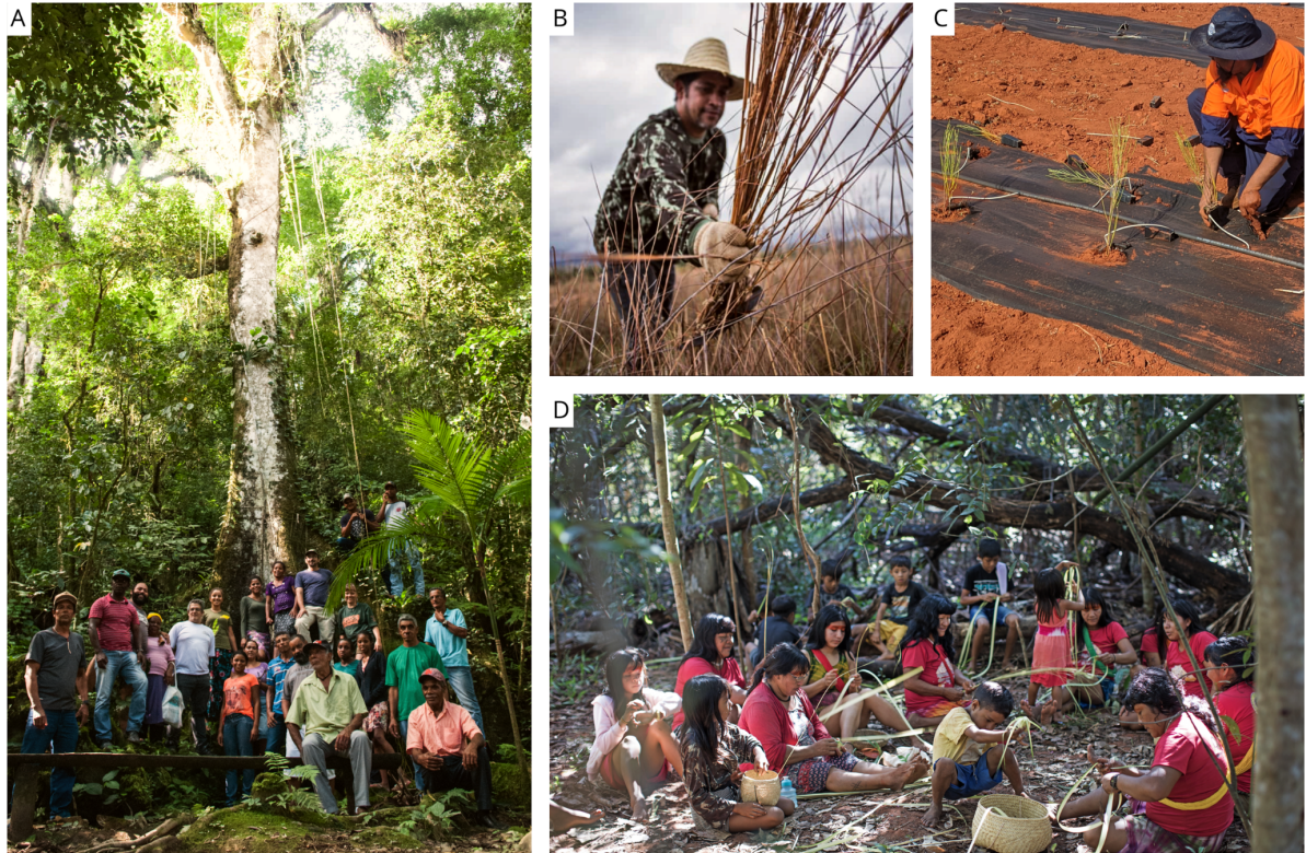
Fig. 3 Community-based native seed supply activities, including (A) A community workshop with seed collectors and practitioners in Vale do Ribeira, Brazil's Atlantic Forest; (B) Native seed grass collection in the Neotropical Savanna of the Central-West region of Brazil; (C) Installation of an Indigenous owned and operated native seed farm in Morawa, Western Australia; (D) Yarang women's movement processing native seed in the Xingu Indigenous Territory, Brazilian Amazon