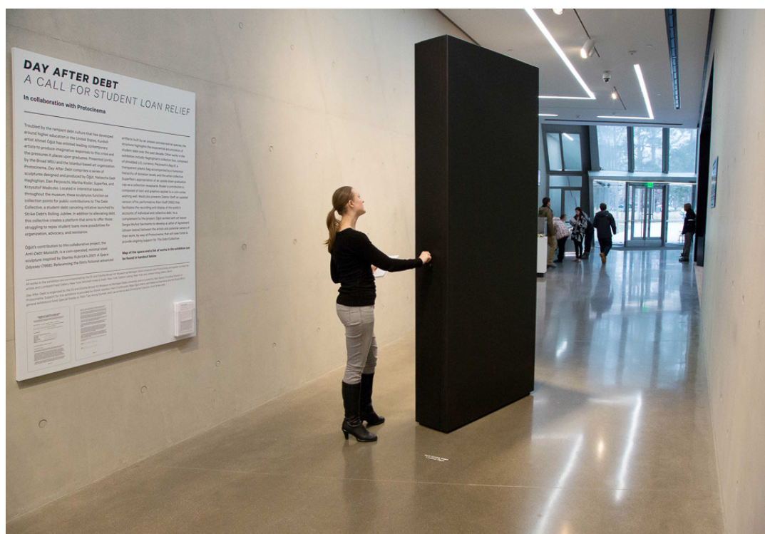
Ahmet Ögüt, “Anti-Debt Monolith”, 2014. Courtesy of the artist and photographer Aaron Word.

individuals and groups, rather than seeking to change things in totality. Both of Ögüt's projects are geared to creating micro-utopias that carry the potentiality to resurface, multiply and/or expand.