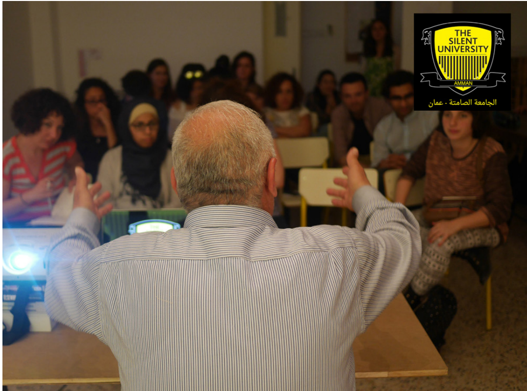
“The Silent University”, 2012 - onwards.