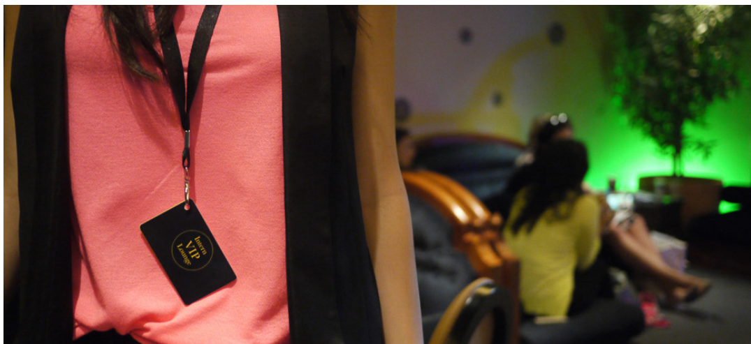
Ahmet Ögüt, “Intern VIP Lounge”, Art Dubai, 2013.

Another shared aspect of these microscopic attempts is that they operate on the level of individual groups. By challenging the logic of capitalist markets, which promote individualism, these art works seek to create communities (albeit temporally) and platforms for solidarity and resistance that can essentially be replicated. Case in point, Ögüt’s “Intern VIP Lounge” provided such a temporal platform for the art interns as a micro-community. Subverting the concept of an art fair lounge, Ögüt’s work offered an “exclusive” space that provided “a relaxed and entertaining ambience, [that also operated] as a knowledge exchange space, with a special programme of events, including meetings, presentations and film screenings”. 2 Essentially, Ögüt’s “Intern VIP Lounge” was a parody of that which has now become a sine qua non of art fairs: the lounge, where the quarter-million-pound-a-piece-paying art-lovers go to sip champagne while mingling with other members of the so-called art world. Although art-workers, which