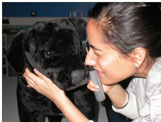
Fig. 1. Student using model eye to practise fundoscopy.