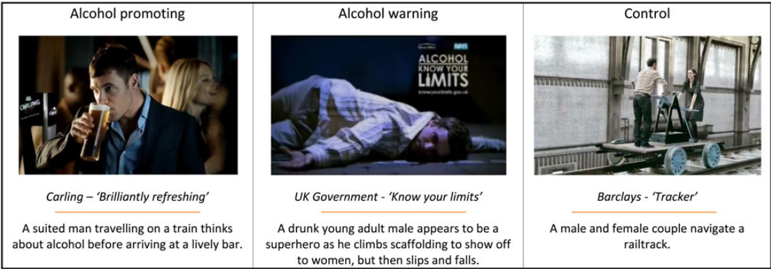
Fig. 1. Example advertisements used in study.

To reduce demand characteristics, questions regarding explicit attitudes were adapted to reflect the control advertisements (banking), e.g. I consider my bank to be: Very pleasant – Very unpleasant . Each of these questions used the same response format as their equivalent alcohol-related question.